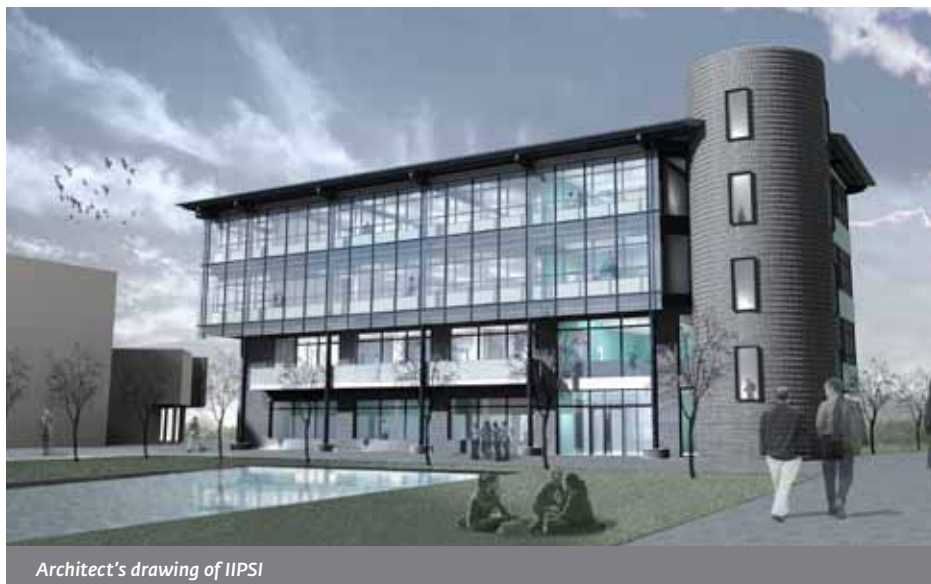
Architect's drawing of IIPSI