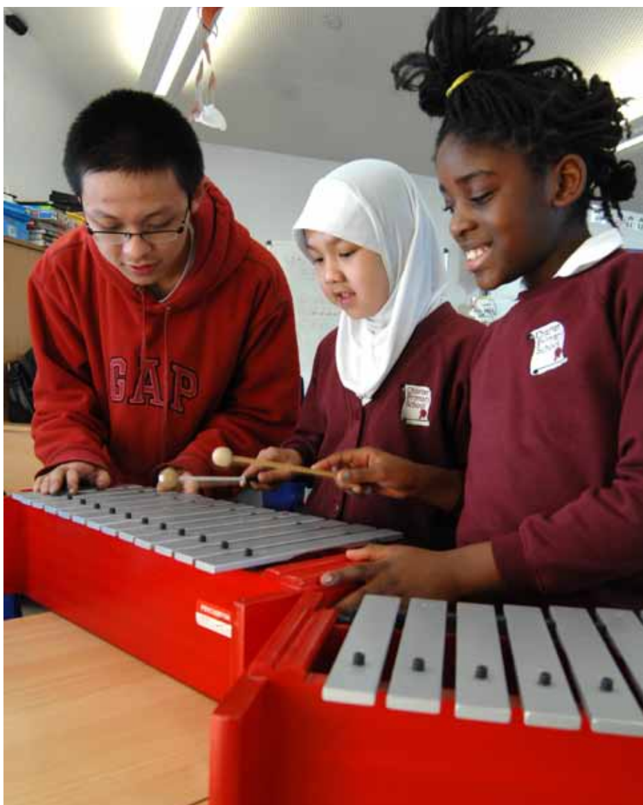
Participation in a Music Matters workshop led by Warwick Volunteers