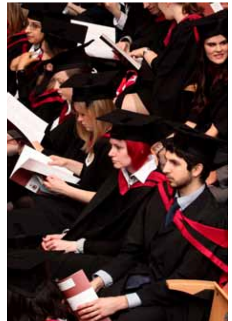
Summer graduation at the University of Warwick

The 4,638 students who graduated from the University this summer benefitted from being taught by world-leading academics, on a campus with a global reputation.