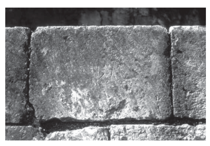
Roche Abbey, mason's mark on nave N. aisle wall.