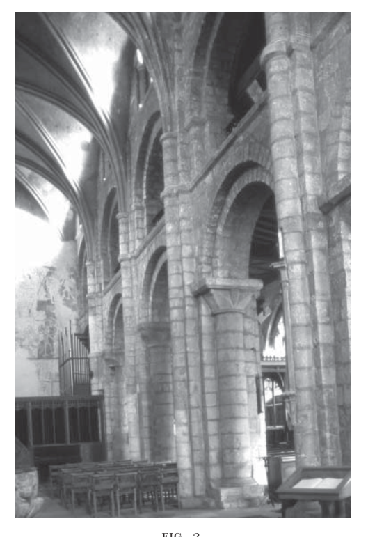
Blyth Priory, nave S. arcade from the W.

it a case of 'early Norman grimness' (Fig. 2). <sup>15</sup> Founded in 1088, building work on the priory seems to have started immediately. Since the only surviving parts are the nave and fragments of the S. transept, work must have progressed rapidly for the nave still to be a late 11th-century construction. <sup>16</sup> Masons' banker marks are present on the nave piers, to a lesser extent on the outside walls, and in the upper parts of the walls above the later vault (Fig. 3). Numbers of marks are not large: about 20% of the walling stone above the nave vault is marked, a slightly higher proportion than we see in other early Norman buildings.