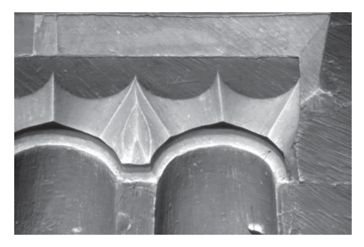
FIG. 4 Tewkesbury Abbey, choir S. aisle respond with mason's mark on capital.