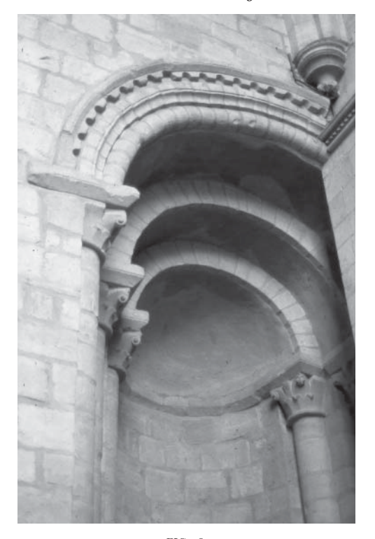
FIG. 1 Lincoln Cathedral NW. front, detail of N. niche.