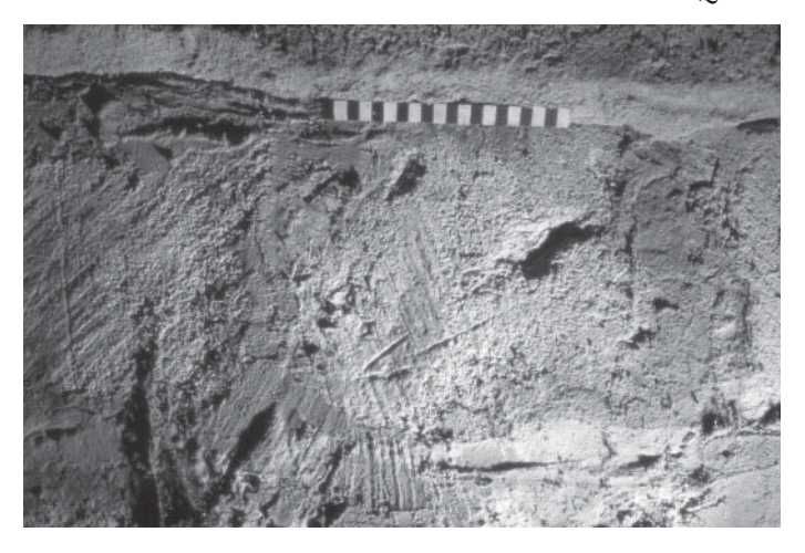
FIG. 3 Blyth Priory, mason's mark on stone above later nave vault.