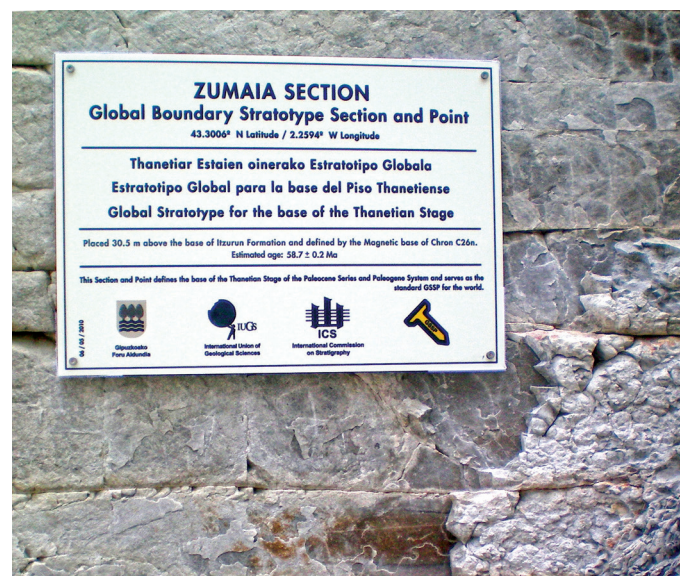
Figure 2. Plaque that marks the Global Standard Stratotype Section and Point (GSSP) for the base of the Thanetian Stage (Paleocene Series, Paleogene System) at Zumaia, the Basque Region, Spain.

Since the first GSSP was ratified in 1972 for the boundary between the Silurian and Devonian systems, 62 of the 100 boundary levels that define the stages, series, and systems of the ICS Chart (download from www.stratigraphy.org ) have ratified GSSPs. Most often, these sites are marked with an explanatory panel, a formal plaque (Fig. 2), and a “golden spike” (Fig. 3).