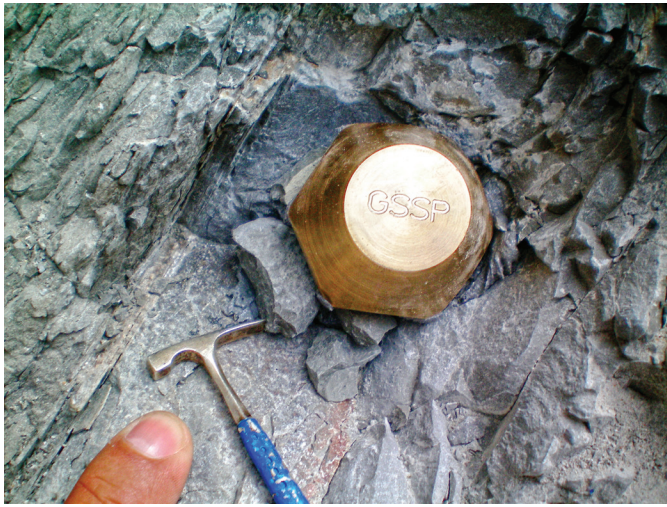
Figure 3. Top of golden spike emplaced in bed that is the Global Standard Stratotype Section and Point (GSSP) for the Thanetian Stage. Length of “rock hammer” is 5 cm.