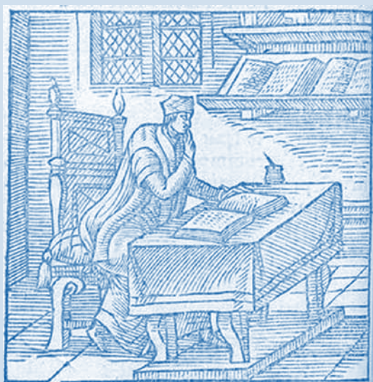
'Silentium' / 'Silence' in Andrea Alciati's Emblemata / Les Emblèmes, Paris, J. Richer, 1584.

Thanks to a Leverhulme Major Research Fellowship commencing in October 2011, this 3-year project will investigate the role of secrecy in the intersecting worlds of Early Modern intellectuals, writers, doctors, political advisors and office-holders. Its central focus will be on the conceptualization and practical implementation of secrecy and semi-secrecy versus public knowledge in the turbulent years of the French Wars of Religion and its aftermath, c.1560-c.1620. Further, French intellectuals and political figures will be situated in the broader European context in which they operated – whether it be through seeking alliances or support for a particular cause, or in the quest for a common religious or intellectual ideal. Then as now, those who needed to ensure secrecy took recourse to all manner of subterfuges, ranging from simple precautions (such as