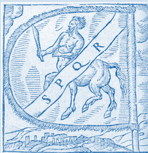
'Quod non vulganda consilia' / 'Qu'il ne faut reveler les secrets des grans' in Andrea Alciati's Emblemata / Les Emblèmes, Paris, J. Richer, 1584

switching languages) to more elaborate ploys (including ciphers, invisible ink, hidden compartments, pseudonyms, passwords and secret signs). Whilst ambassadors worried about intercepted packages, couriers and emissaries often carried oral instructions in addition to actual letters; the travel of scholars, physicians and book merchants too provided a plausible cover for undertakings that were sensitive in political or religious terms.