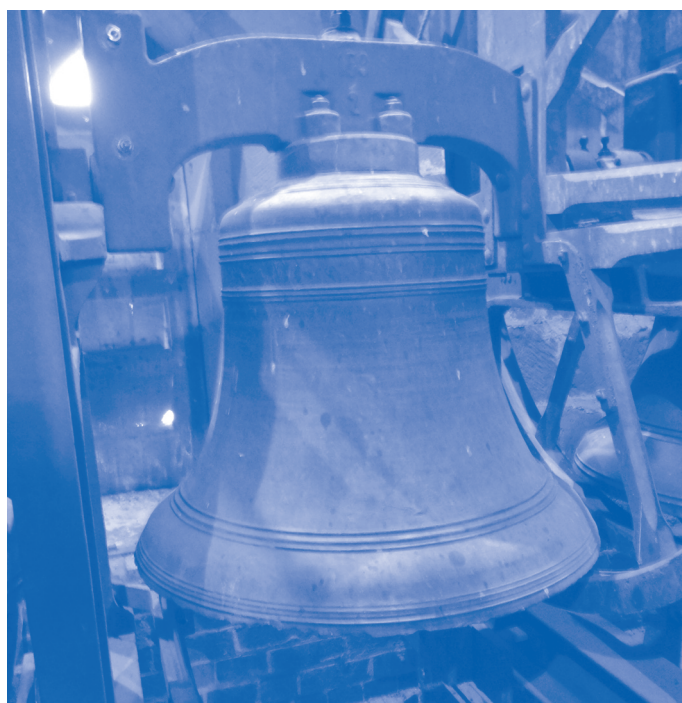
Bell No. 2