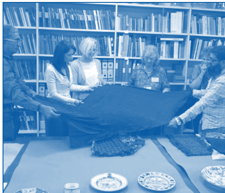
Handling session, Ashmolean Museum, Oxford

The workshop took place on the last weekend of June. The Ashmolean Museum in Oxford generously provided the workshop with space and material for handling sessions. Speakers included guests from different centres for the