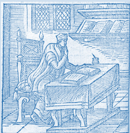
'Silentium' / 'Silence' in Andrea Alciati's Emblemata / Les Emblèmes, Paris, J. Richer, 1584

Thanks to a Leverhulme Major Research Fellowship commencing in October 2011, this 3-year project will investigate the role of secrecy in the intersecting worlds of Early Modern intellectuals, writers, doctors, political advisors and office-holders. Its central focus will be on the conceptualization and practical implementation of secrecy and semi-secrecy versus public knowledge in the turbulent years of the French Wars of Religion and its aftermath, c.1560-c.1620. Further, French intellectuals and political figures will be situated in the broader European context in which they operated – whether it be through seeking alliances or support for a particular cause, or in the quest for a common religious or intellectual ideal. Then as now, those who needed to ensure secrecy took recourse to all manner of subterfuges, ranging from simple precautions (such as