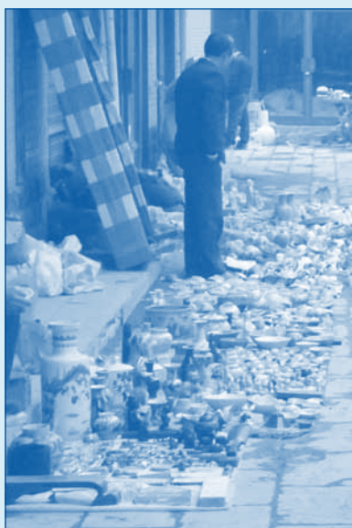
Shard Market, Jingdezhen, April 2011

and engraved bricks from city walls, but mostly the traders sell broken bits and pieces of locally-made old porcelain. For less than a pound one can buy the base of a bowl with an imperial reign mark of the seventeenth century, and for two or three pounds, the stem of a cup used during the time when the Mongols ruled Chinese territory in the fourteenth century.