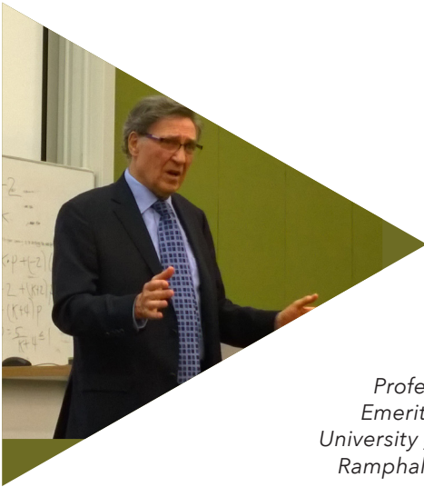
Professor Jack Zipes, Emeritus at Minnesota University giving his talk in Ramphal on the Grimms' fairy tales.