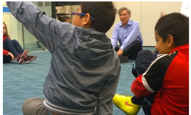
Professor Jack Zipes asking young people at Coventry Council questions about fairy tales