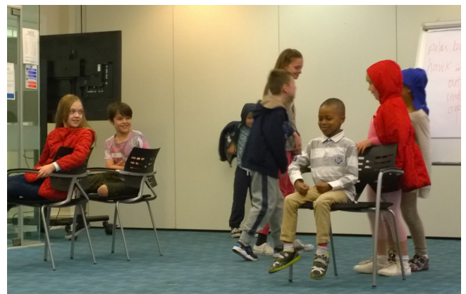
Young people from schools in Coventry acting out their version of Polly and the Wolf, an alternative Little Red Riding Hood Story. Here two wolves approach two Polly's (in red and blue) with her family in the car.