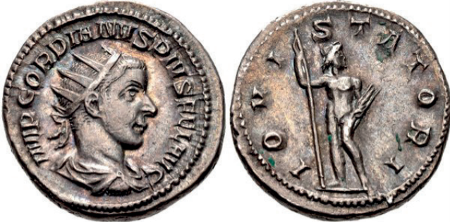
Debased silver coin of the Roman emperor Gordian III (AD 238-244).