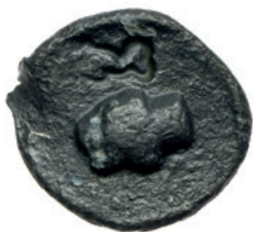
Fig. 1 Athenian token of the 3 rd century AD with lion head r. and dolphin countermark from the hoard at the Roman House (Athenian Agora IL231)

A hoard of 62 lead tokens (fig. 1) which were excavated in the 1930ies in the Athenian Agora were re-examined in the course of the research for the ERC Project Token Communities in the Ancient Mediterranean. The results were remarkable: the tokens played powerful roles in asserting the prestige of the political and religious elite of Athens in the period previous to the Herulian sack in 267 AD. The paper, which was announced in the International Conference held at the University of Warwick, 8 th -10 th June 2017 will be published in the Proceedings Volume, a RNS special publication volume. A short video is already on the Departmental Web Page: warwick.ac.uk/fac/arts/classics/research/dept_projects/tcam