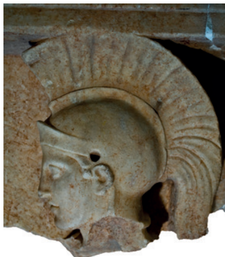
Fig. 3 Athena from the Amphiglyphon in Platons's Academy (Ephorate of Athens Antiquities M3112)

The double sided relief of the late 5 th century with a representation of Athena (fig. 3) on the obverse and Centauromachy on the reverse sheds new light to the cults of Platon's Academy and Athenian Ideology in the time of crisis, brought about in the aftermath of the Peloponnesian War. The paper will be published in the next issue of the peer reviewed journal Mitteilungen des Deutschen Archäologischen Instituts Athenische Abteilung .