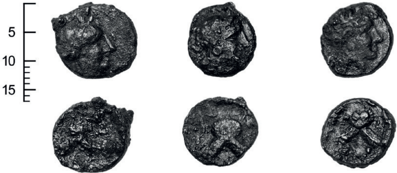
Fig. 2 Athenian bronze coins with the double bodied owl from the hoard at Limani Pasha (Laurion Mouseion ML296)