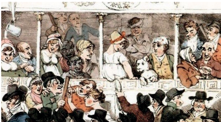
The Boxes , Thomas Rowlandson (1809)

The first day of the conference began with two parallel sessions, which explored an array of themes in relation to exclusionary cultures: from isolation and othering