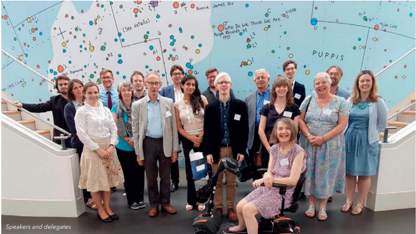
Speakers and delegates

ground floor of the Ramphal Building using its innovative presentational teaching spaces (R0.03/4 and R0.12). In total 16 papers (20 minutes each), and 2 keynote plenary addresses (45 minutes each), were delivered as part of the event's full programme. Simultaneous panels ensured a wide range of topics were covered from Shakespeare to Dryden, from accounts of sickness to martyrdom, and from sermon notes to autobiographical writing. A total of 27 delegates attended, representing 13 different universities from across both the Atlantic and the English Channel.