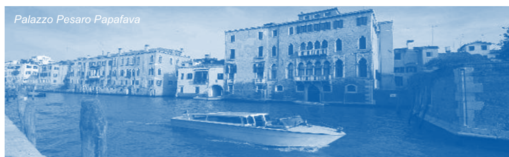
Palazzo Pesaro Papafava