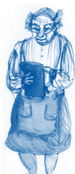
Peter Quince in Footsbarn's A Midsummer Night's Dream 2008, courtesy of Warwick Arts Society