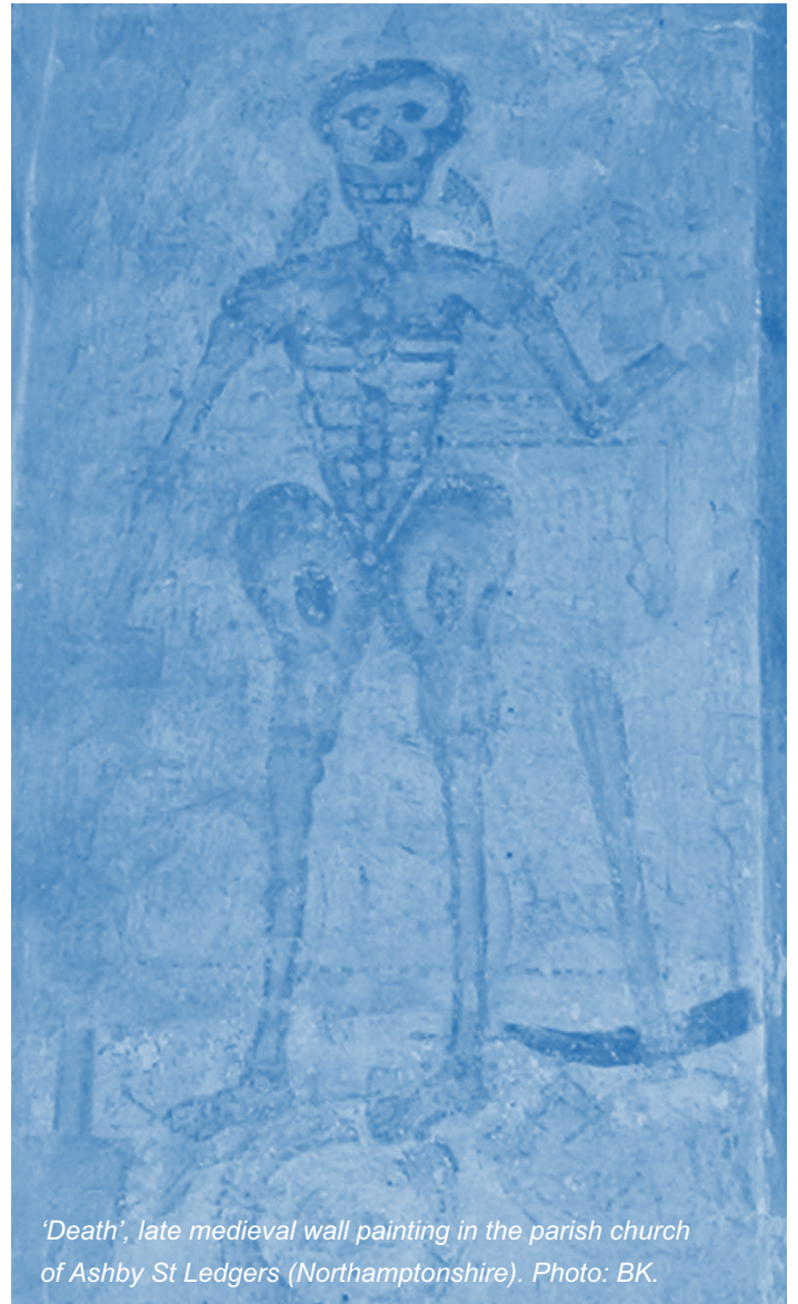
'Death', late medieval wall painting in the parish church of Ashby St Ledgers (Northamptonshire).