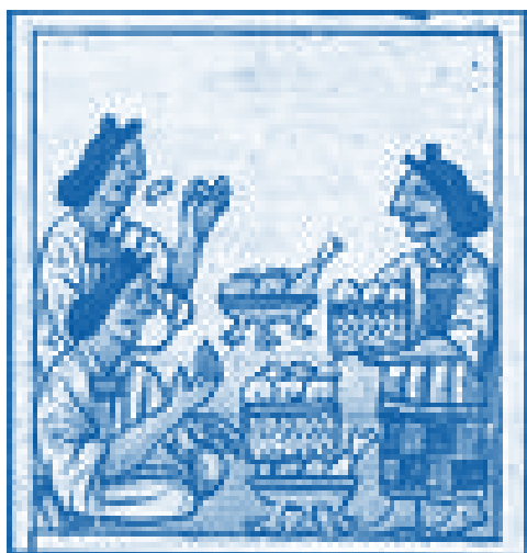
Aztec women prepare a meal Florentine Codex

During the Spanish conquest of the Americas, two scenes typify the encounters between Europeans and Amerindians: a battle, and a shared meal. When indigenous peoples and Iberians did not try to kill each other, they usually ate together. Hungry Spaniards were often desperate for food, and Amerindians were curious about the peculiar things consumed by the exotic bearded strangers. Spanish chronicles are full of descriptions of such communal meals. In December 1492 Columbus recorded in his journal that after landing on one Caribbean island he offered a local ruler ‘Castilian food’. Columbus did not describe the king’s reaction, beyond noting that he ate only a mouthful, giving the rest to his entourage. Other accounts offer more detail.