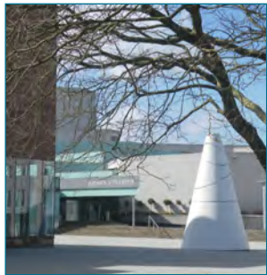
65. Warwick Arts Centre