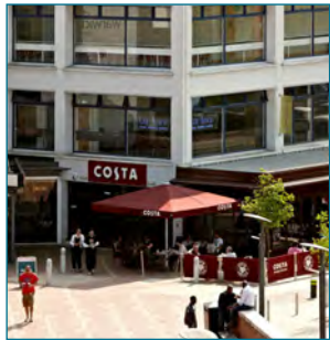
53. Roots Building, Conference Park