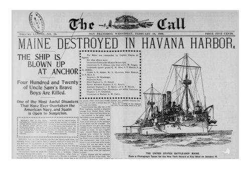
A report on the destruction of the USS Maine. © Library of Congress, Chronicling America (San Francisco Call, February 16, 1898, p. 1).

In addition to these privately created resources, various public bodies in the US have digitised a significant and growing number of newspapers to which the public has free access. The most exciting of these initiatives is the Library of Congress's Chronicling America project. When completed in 2011, this database will include representative newspaper pages from the history of each state from 1836 to 1922. There are many other projects. For example, the Brooklyn Public Library has made available a full run of the Brooklyn Daily Eagle from 1841 to 1902 and plans to digitise the remaining issues for the periods 1903–55 and 1960–3. Rural newspapers have also been digitised, providing distinctive local perspectives. For example, the Northern New York Library Network has digitised full runs of a variety of local newspapers including one dating back to 1811. In addition to newspapers published for a general