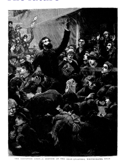
The Salvation Army: a service at its headquarters in Whitechapel Road. (The Graphic, December 31, 1881, p. 672).

Two important omissions from the current freely accessible English-language databases are newspapers from the former African and Asian colonies of the British Empire, with the exception of Palestine, Singapore and Malaysia. This is an example of a north-south digital divide. Perhaps the digitisation of representative newspapers on a non-subscription basis from these former British African and Asian colonies. is a project that might come within the scope of the Commonwealth. There is undoubtedly a wealth of historical information in British colonial newspapers that could be made much more accessible by a non-commercial digitisation project. The National Library of Singapore's digitised newspapers resource provides an excellent example of what could be achieved.