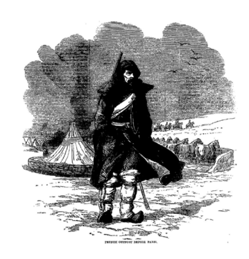
French outpost before Paris (Penny Illustrated Paper, January 14, 1871, p. 24).

The digitised newspaper resources discussed in this booklet are less useful for European history. Most British undergraduate historians will not be able to access digitised historic newspapers in various European languages, one of the most significant collections being the digitised historic French newspapers available at the French National Library's website http://gallica.bnf.fr However, as shown in the previous case study, the British press did cover major events in 19th-century Europe, in particular wars. Another good example is the Franco-Prussian War of 1870–1 and the Paris Commune of 1871, which was covered in depth by the British press, including a significant number of the newspapers digitised by the British Library. So those students not able to read the official newspaper of the Paris Commune, which