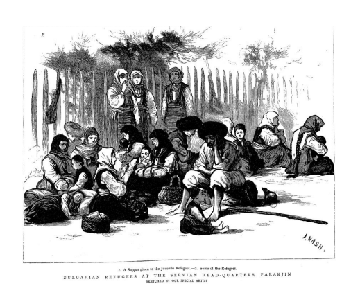
Bulgarian refugees at the Servian [Serbian] headquarters, Parakjin. (The Graphic, August 5, 1876, p. 132.)

The first Foreign Secretary of the Labour government of 1997–2010, the late Robin Cook, sought to adopt an 'ethical foreign policy'. Cook was drawing upon the legacy of the 19th-century Liberal politician, William Gladstone, as this case study demonstrates. The Russo-Turkish War of 1877–8 shows how newspaper reports of atrocities committed by governments in foreign countries can influence public opinion and, in response, politicians. The British Library resource includes a full run of the London Daily News. In the summer of 1876, the Daily News published reports by their correspondent, Januarius MacGahan, on the massacre of Bulgarian villagers by irregular soldiers employed by the Ottoman Empire. At the time the British