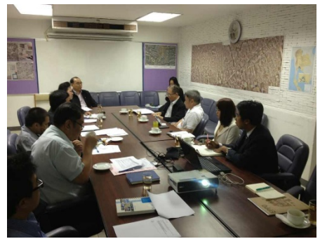
Figure 1 shows the first meeting between the project team and representatives of the Housing Development Department of NHA.

On January 14, 2014, the Thai project team met with 11 representatives from NHA at Building 2 in the NHA compound in Bangkok. Figure 1 shows a photograph taken during the meeting. The project team introduced team members, described the main objective of the project and work plan to the Director, the Vice-Director, and 10 researchers/staff of the Housing Development Department of NHA. The NHA representatives agreed to appoint a team to work on a collaboration research with the project team. The NHA representatives also asked for the knowledge transfer from the research team. The research team from KMUTT might give a lecture related to energy efficiency in buildings and also details of this project to NHA staffs. The research team agreed with the idea. A lecture or training will be carried out in the future at NHA. A formal letter of invitation to the director of NHA for collaborative research was later submitted and a formal letter of response was received. The NHA welcome the invitation and assigned a deputy director of Housing Development Department to work with the project team. Another round of meeting between the project team and the team from the NHA is planned to initiate the collaborative research, first to create a joint research plan, to assess training needs for NHA personnel, and to elaborate on methodology of research.