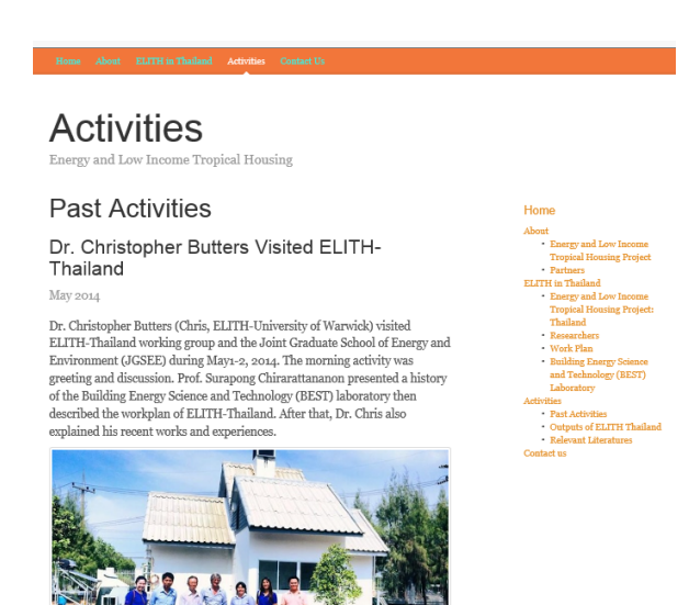
Fig. 1 Examples of pages in ELITH-Thailand website

There are 5 menus of ELITH-Thailand website, including: (1) Home; (2) About (ELITH and Partners); (3) ELITH in Thailand (Overview, Objective, Beneficiaries, Work Plan, and Project Team); (4) Activities (Past Activities, Outputs of ELITH Thailand, and Relevant Literatures); and (5) Contact Us. The most important part of this website is "Activities", which is in the project plan (dissemination) of ELITH.