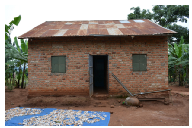
Figure 2: Typical rural dwelling

The wider study took in a variety of housing typologies as part of an assessment of construction materials used in typical rural dwellings. Data was collected from 64 housing units, which ranged in size from a modest 6sq.m. for a single room dwelling, to 90sq.m. for a six-room detached house. The survey gathered information on materials commonly utilised in the construction of various elements in the building. The most dominant typology was found to be a four (4) room dwelling with an area of between 45 and 60sq.m., built of fired clay bricks and roofed predominantly with corrugated steel sheets (Fig. 2 and Fig. 3). This typology represented a typical dwelling across the rural environment of Uganda, and what many rural (and urban) dwellers aspire to as they seek their own housing. This housing type thus typifies not only the most dominant dwelling type today, but also potentially the most dominant typology into the near future.