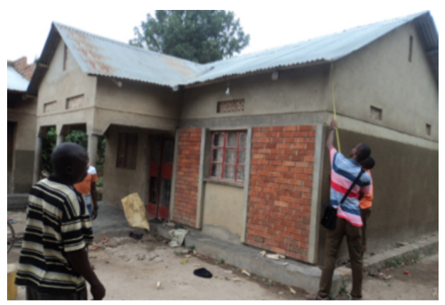
Figure 3: Contemporary rural dwelling

The substructure of the buildings generally comprised of mass concrete strip footings with fire clay bricks forming the plinth walls. In many cases, floors were built after the walls had been completed - built room by room, with buildings that made use of trained builders the only ones to make use of an over-site-slab on top of the plinth wall, onto which the superstructure was built. The floor was generally mass concrete, with the occasional building making use of brick or compacted earth. The predominant floor finish was cement screed overlaid on the mass concrete or brickwork.