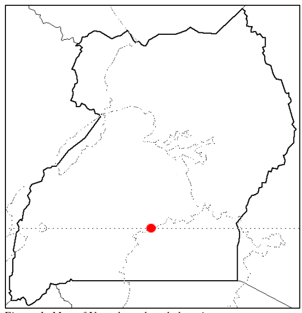
Figure 1: Map of Uganda and study location

The study was undertaken in a semi rural setting, based around the township of Nkozi, situated 84km southwest of Uganda's capital Kampala (Fig. 1). The choice of study location was based on previous engagement with the community in the area, an important factor to enable access to dwellings, and to ensure the validity of collected data.