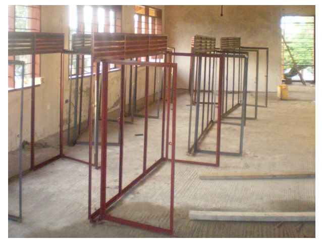
Figure 5: On site construction of steel window frames

traditional timber shutters. Rooms generally had a single window, with an average area of about one square metre. This was similar for buildings with timber shutters and those with glazed windows, suggesting a direct substitution of timber shutters for steel windows. Timber again was sourced from local carpentry shops, however glass and steel used for windows - generally 25mm steel angles - were sourced either locally, or in Kampala depending on whether they were bought piecemeal or in bulk (Fig. 5). Although steel is manufactured in Uganda, products are generally of poor quality, largely produced from recycled scrap, and due to the lack of quality control is not recommended for structural purposes - although the major outputs of these plants is re-bar. Steel products are largely imported from Kenya, or further afield; from South Africa India, or China. It was however difficult to trace the origin of the steel being used, thus a key assumption was that steel used was generally imported from Kenya, given much of what was used were steel angle bars.