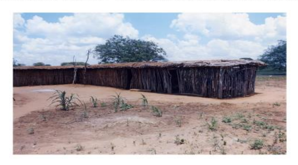
Plate 2: An example of poor rural house.