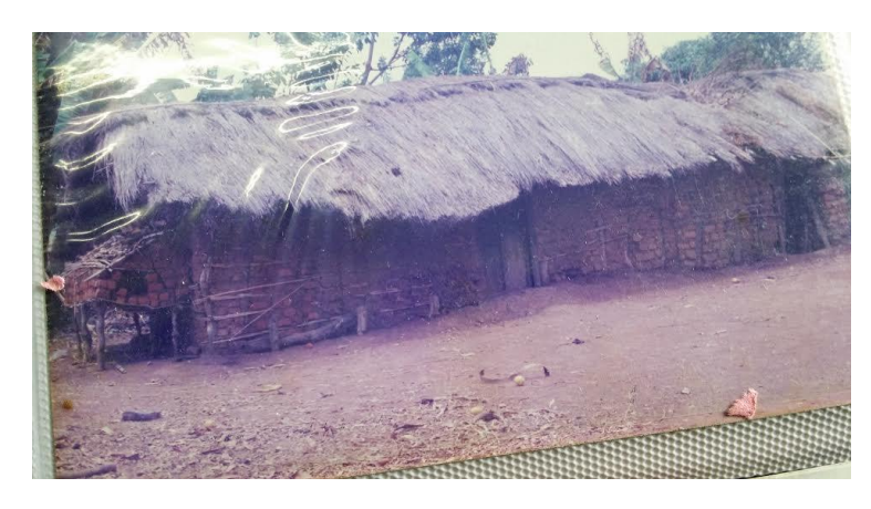
Plate 1: An example of poor rural house.