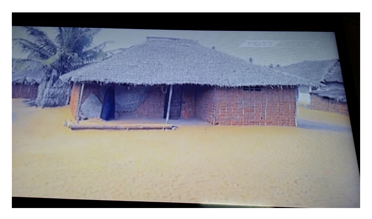
Plate 3: An example of poor rural house.