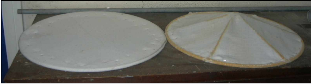
Figure 1: Filter designs tested

Each design was tested with two fabric types.