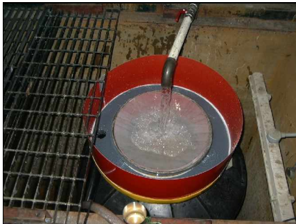
Figure 2: Filters under test

For tests of filter effectiveness, the water in the filtered water tank was drained and the tank rinsed through a set ISO 3310/1 sieves to measure the particulate load the filter had let pass. This was then compared to the particulate load of the feed water to obtain the filter effectiveness. Only one effectiveness test was done on each filter in this first set of experiments.