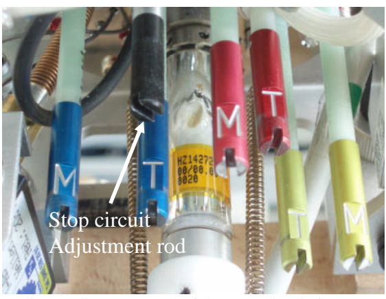
Fig.5 Adjustment rod of the stop circuit frequency

1. Adjust the stop circuit frequency by turning the black rod at the bottom of the probe, see Fig.5 and observe the insolation at the Network- Analyzer, see Fig.6 and Fig.7