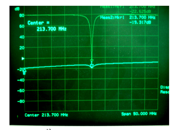
Fig. 7 <sup>13</sup>C stop circuit frequency optimized