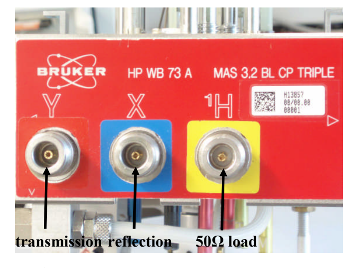
Fig.2 probe connectors