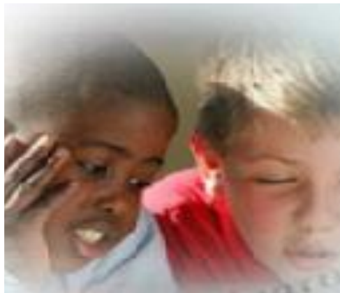
Language & Learning