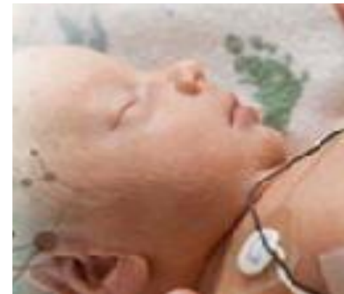
Lifespan Health & Wellbeing