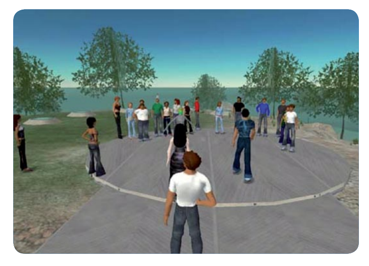
Figure 2: Second Life. Image reproduced by kind permission of Linden Labs UK.

Serious games and virtual worlds allow us the potential to: