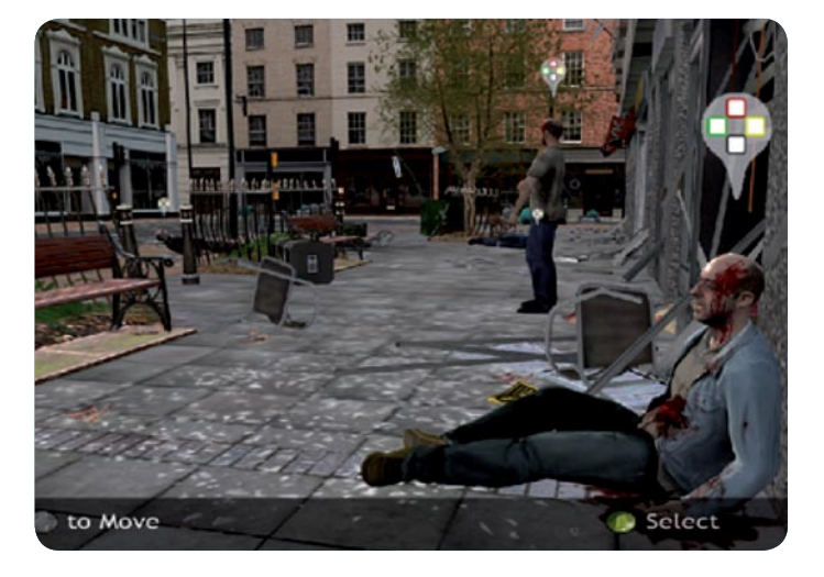
Figure 3: Triage Trainer. Reproduced by kind permission of TruSim (A Division of Blitz Games)