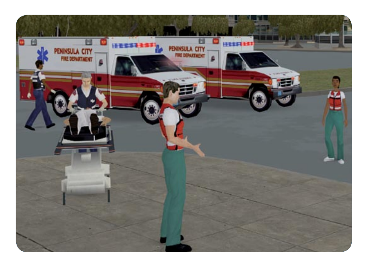
Figure 4: Screen shot from emergency training session using Forterra. Developed by Forterra Systems .

One interesting example of how Second Life is being used is the use of Teen Second Life (for use by teenagers only) by the Open University. Here, students from the National Association for Gifted and Talented Youth (NAGTY) are taking lessons in virtual classrooms. The pilot developed under Schome, is a project aimed at developing new education systems in both real and virtual worlds. [http://schome.open.ac.uk/ wikiworks/index.php/The_schome-NAGTY_ Teen_Second_Life_Pilot]