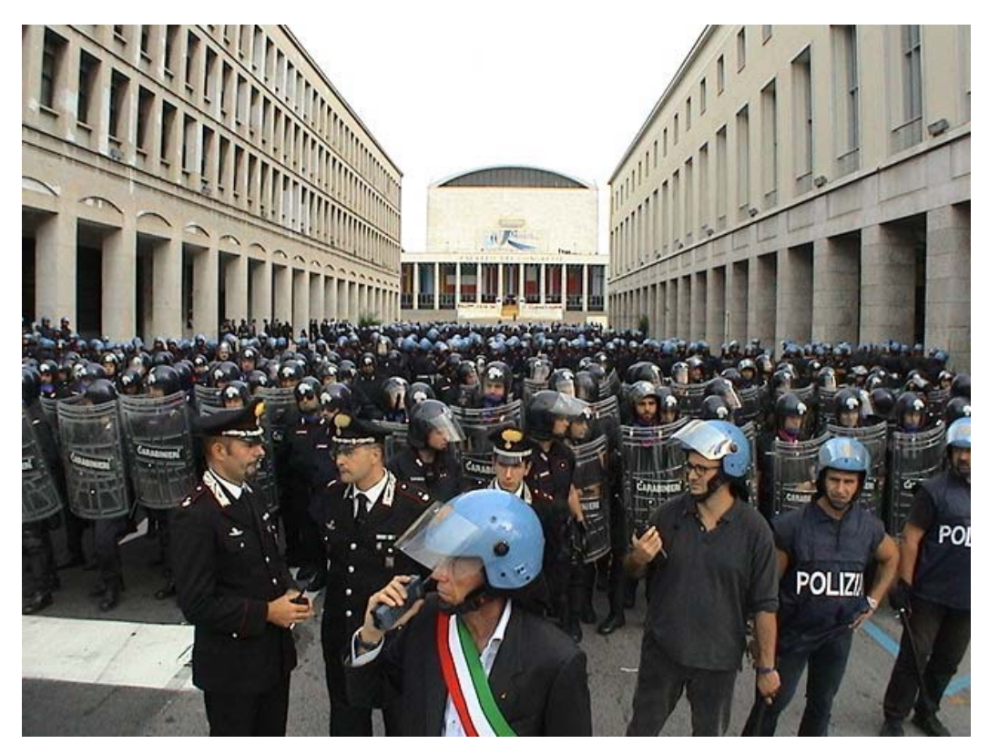
Plate 6. A small percentage of the visible police presence that marked constitutional discussions at the EU 'Intergovernmental Conference on the Future of the Union', Rome, 6 October 2003.

Further, just as the structural and political violence of neoliberalism sediments into interpersonal violence in everyday domains (Bourgois 2001: 29) – constituting what Bourdieu refers to as the 'law of the conservation of violence' – violence in the context of protests also easily shifts between the 'meaningful' political act into the boring violence of the everyday: viz reported incidents at Thessaloniki of molotovs being thrown into buildings whilst antiauthoritarian 'comrades' were inside, and the potentially disastrous impacts on 'ordinary people' inhabiting apartments immediately above burning commercial outlets (also cf. Marcellus 2003)<sup>27</sup>. And there are implications too for gender-politics. From the Celtic women warriors of Britain at the time of Roman imperial expansion (e.g. Lothene Experimental Archaeology n.d.) to women pirates worldwide in recent centuries (Klausmann et al. 1997), bio-political violence clearly is not an exclusively male domain (also Ruins 2003; LeBrun n.d.). But a strengthening of particular 'hegemonic masculinities', i.e. that valorise physical strength, machismo (in relation to other men as well as to women), and emotional passivity (discussed in Cross 2003: 14-15; also Viejo 2003), perhaps does generate its own momentum and problematic – one which again becomes akin to that also represented by the machismo of a male-dominated, body-armoured riot police (cf. Plate 7). Given reports of sexual harassment