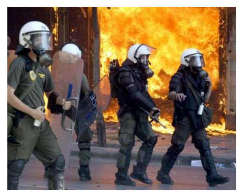
Plate 3. a. Protester throwing a Molotov cocktail, and b. Greek police against a burning building, on Egnatia Street, Thessaloniki, during the anti-authoritarian action against the EU summit on 21 June 2003.

A campaign against the June 2003 EU summit meetings in Thessaloniki had been planned for over a year, to register popular protest against 'the anti-peoples' orientation of the European Union during the Greek presidency of the EU', and to organise a 'counter-summit' to coincide with the EU meeting (e.g. Yechury 2003: 1; PAME 2002). The protests were staged as a manifestation of the 'democratic deficit' of the EU (cf. Habermas 2001: 14), i.e. whereby citizens do not feel represented by, or able to participate in, decisions made by those