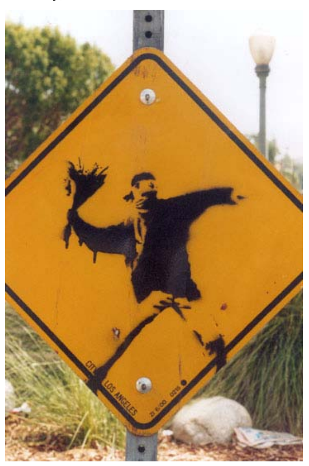
Plate 8. Attacking with flowers instead of molotovs. Banksy stencil. Source: On-line. Banksy n.d..

For myself, I have in mind a brilliant image by graffiti artist Banksy, of a masked protester with arm raised to violently throw – not a molotov, but a bunch of flowers (see Plate 8). For me, this captures both the engaged anger and the seriously subversive and celebratory creativity comprising the hallmarks of a global anti-capitalism that has its feet planted firmly in the 21<sup>st</sup> century. This is a processual, interstitial , Dionysian radical politics that exploits, explodes, and subverts the instability of correspondences between signifier and signified, inside and outside, the messiness of experience and the reified categories of modernity. In doing so it attempts a continual transcendence – a going beyond – that acknowledges the destruction inherent in creativity, but that is not a call for nihilism as an end in itself.