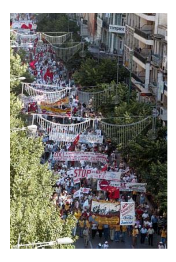
Plate 2. March on Tsimiski Street, Thessaloniki, organised by the Communist Party of Greece as part of the National Day of demonstrations on 21 June 2003 against the EU summit. The Greek Social Forum marched from east to west along Egnatia to meet the Open Assembly of Anarchists and Anti-Authoritarians who moved from the squatted Aristotle University to meet them (and the riot police) at Aristotelous Square (for a map of the city go to Citymap Thessaloniki 2003).