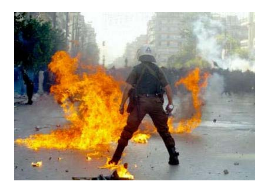
Plate 7. Police at the EU summit, Thessaloniki, June 2003. I could not resist including this classic image of machismo. But I note that while it might generate humour when consumed as a picture, the experience of riot police in the streets is anything but funny.

made by women at the anarchist encampment at Thessaloniki's Aristotle University in June 2003, for example, it indeed is tempting to see an emerging dynamic in militant factions whereby 'worthy' political violence is transmuted and normalised 'back' into the banal and disempowering violence of everyday sexism<sup>28</sup>.