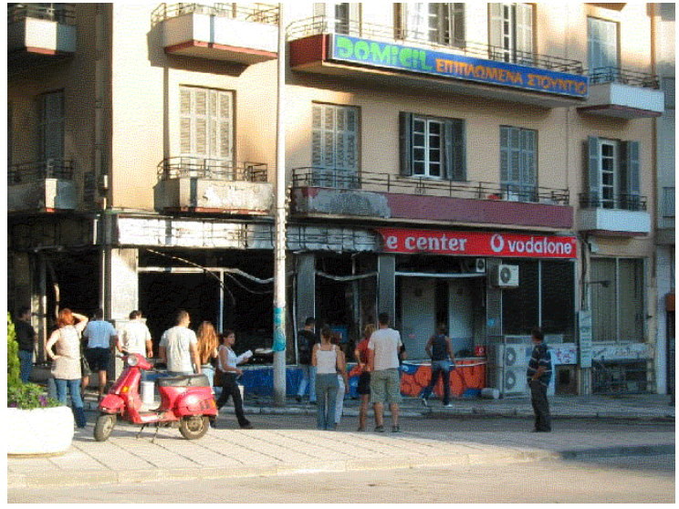
Plate 4. Although a number of small, independent businesses were affected by the antiauthoritarian action in Thessaloniki on 21<sup>st</sup> June 2003, international corporate targets – perceived as both symbolic and direct representations of a world political-economic system of injustices and constraints – were subject to the greatest damage. 4a shows the burnt out McDonalds on Egnatia Street and 4b. is of a nearby Vodaphone store.