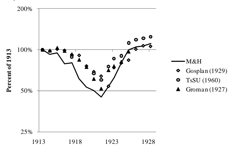
Figure A1. Agricultural Production on Soviet Territory, 1913 to 1928: Alternative estimates, per cent of 1913