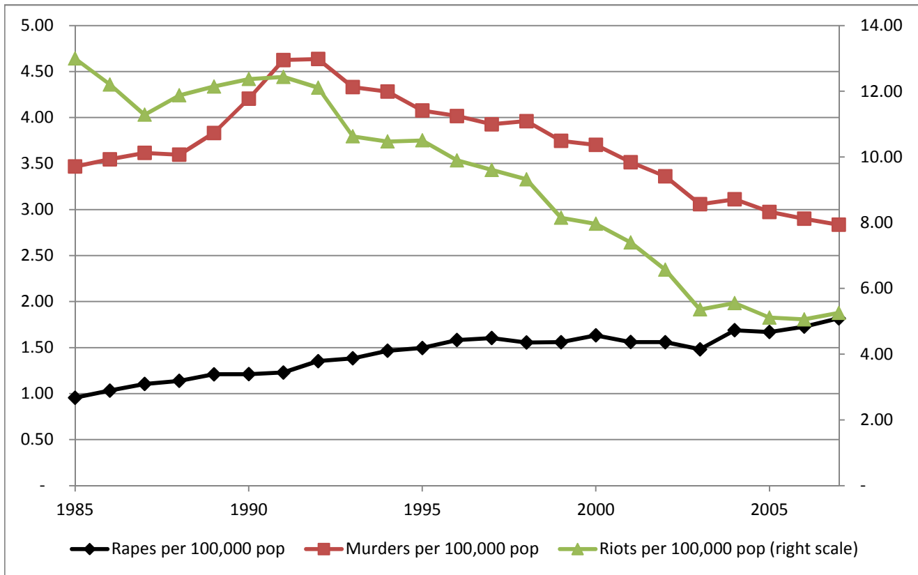
Figure I Nationwide Trends in Selected Crime Categories