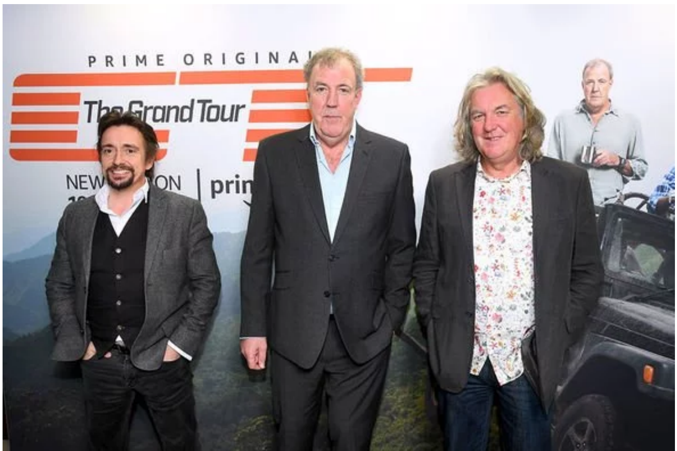
Jeremy Clarkson alongside The Grand Tour hosts Richard Hammond and James May

As before, they still have the option to choose between lifelines; ask the audience, call a friend and the 50/50 option.