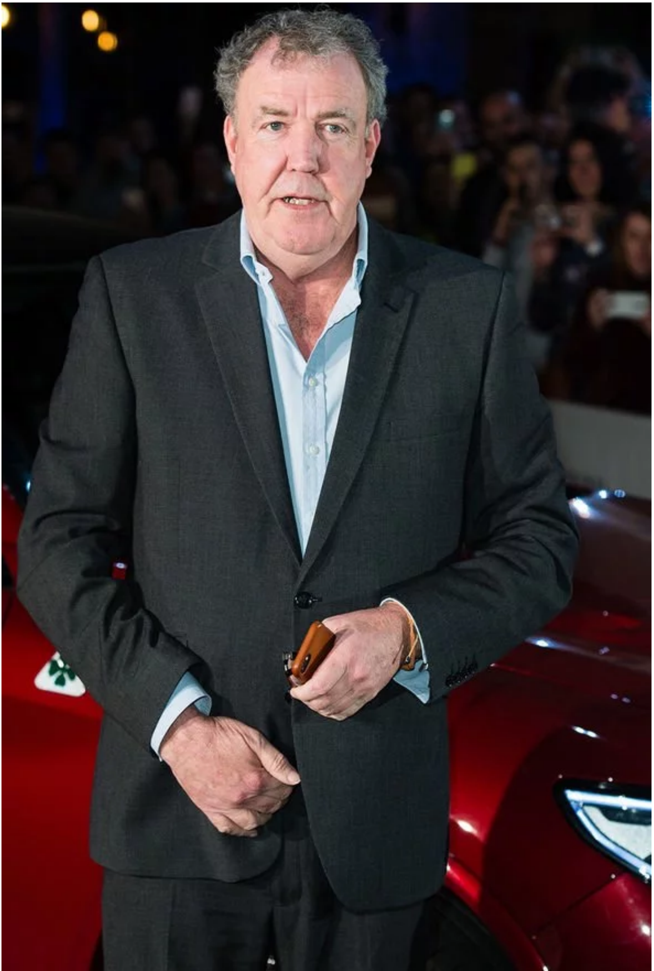
Jeremy Clarkson: Who Wants To Be A Millionaire host shared his thoughts about a recent study

"I wanted to top myself, but that wasn't possible either, because the gravediggers were on strike as well. So yes, 1978 was pretty terrible."