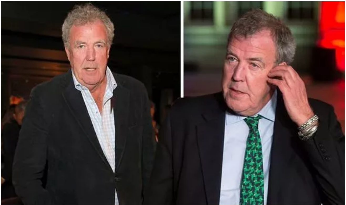
Jeremy Clarkson: Who Wants To Be A Millionaire host shared his thoughts on Britain's 'worst year'