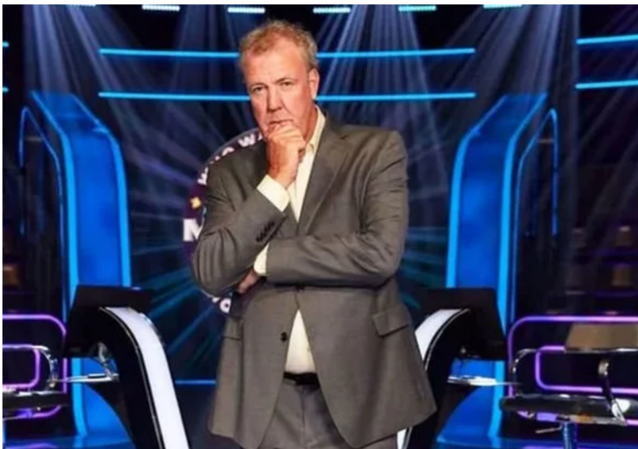
Jeremy Clarkson fronts Who Wants To Be A Millionaire? on ITV

Jeremy Clarkson sparks 'concern' from neighbours (/celebrity-news/1190230/jeremy-clarkson-who-wants-to-be-a-millionaire-farm-shop-neighbours-latest-news)