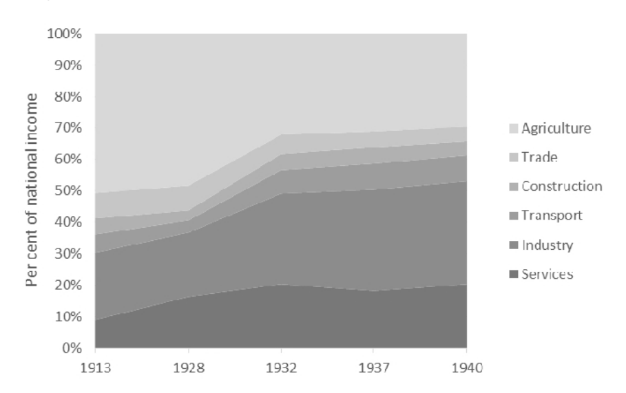
Figure 2. Russian and Soviet national income by origin, 1913 to 1940, per cent of total

Per cent shares are calculated at 1913 prices for 1913 and 1928, and at 1937 factor costs for 1937 and 1940.