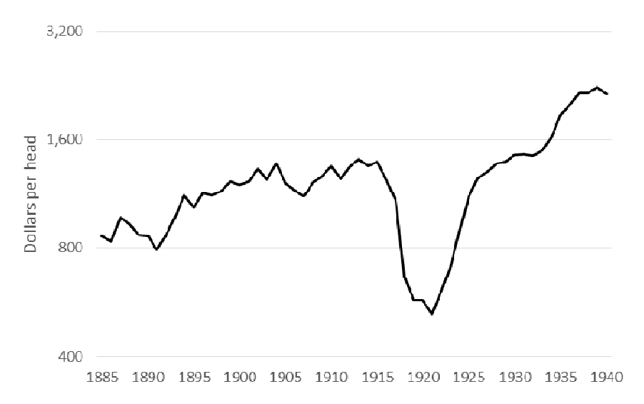
Figure 1. Russia and the Soviet Union: Real national income per head in international dollars and 1990 prices

Source: Markevich and Harrison, 'Great War, Civil War', 693 and Appendix, Table A39. Figures are for Russian Empire territory (excluding Finland and Poland) to 1917, and for Soviet interwar territory otherwise.