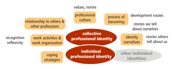
Figure 2: Elements of Professional Identity

A core concept driving the implementation of learning innovations in PES is professional identity transformation. Professional identity consists of many different elements that interrelate as depicted in Fig. 2. First of all, professional identity has an individual and a collective dimension, and for individuals it is linked to other aspects of their personal identities, relating to other life roles. Identity encompasses work activities and work organization, the relationship with other professions, and the professional culture as well as processes of becoming part of the profession [3].