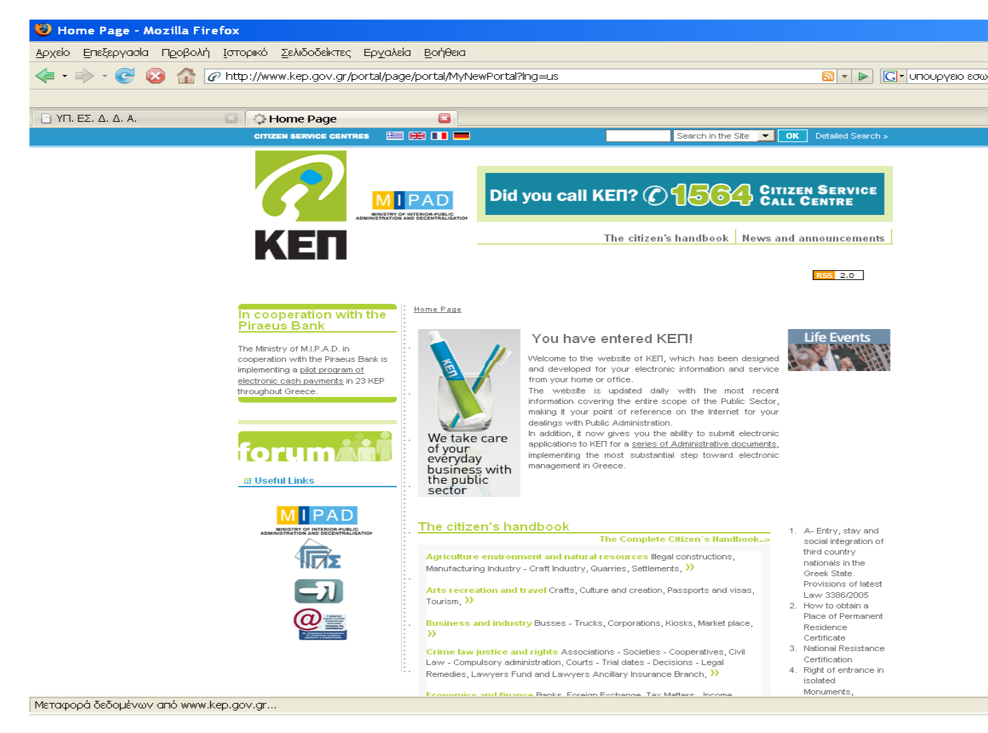
Figure 2: The Citizens' Centre Portal