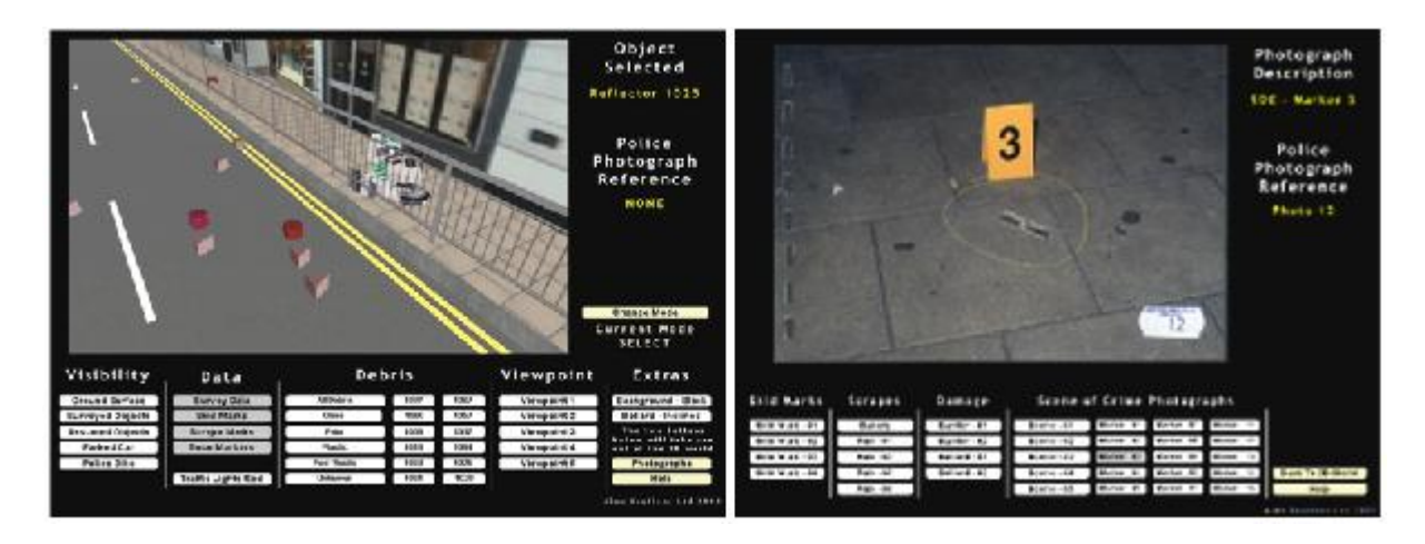
Figure 5. Image from a Virtual Simulation of a the Vehicle Debris at the Murder Scene

This virtual simulation was used during the trial as a primary evidence display mechanism and helped to successfully convict the principal defendant and his associates of murder (West Midlands CPS, 2003).