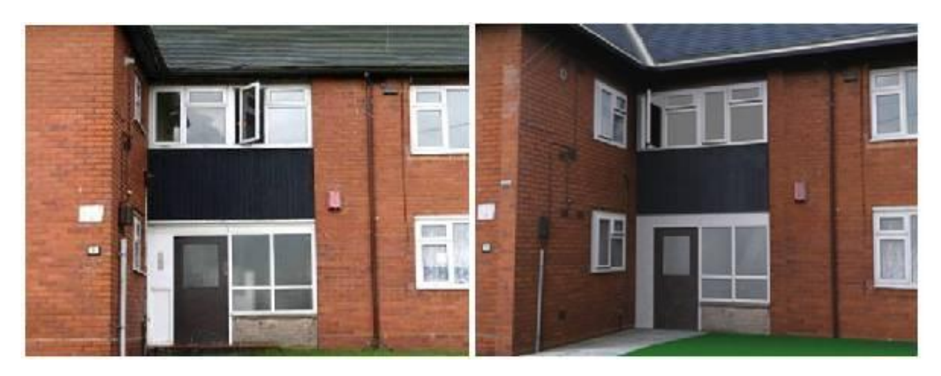
Figure 3. A Photograph and an Image from a Forensic Animation of a Crime Scene

The third forensic animation case involves a virtual reconstruction created for the Independent Police Complaints Commission (IPCC) in the UK. This reconstruction related to the fatal shooting of a civilian by police armed response unit in 2005 (Schofield, 2007).