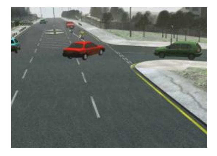
Figure 1. An Image from a Forensic Animation of a Road Traffic Accident

Such computer games technology has been used to recreate a number of road traffic accidents in both criminal and civil courtrooms in the UK. In these cases it has been possible to show views of these road traffic accidents from the viewpoints of the vehicles and pedestrians involved, and also from the viewpoint of a range of witnesses (Noond et al, 2002)<sup>7</sup>.