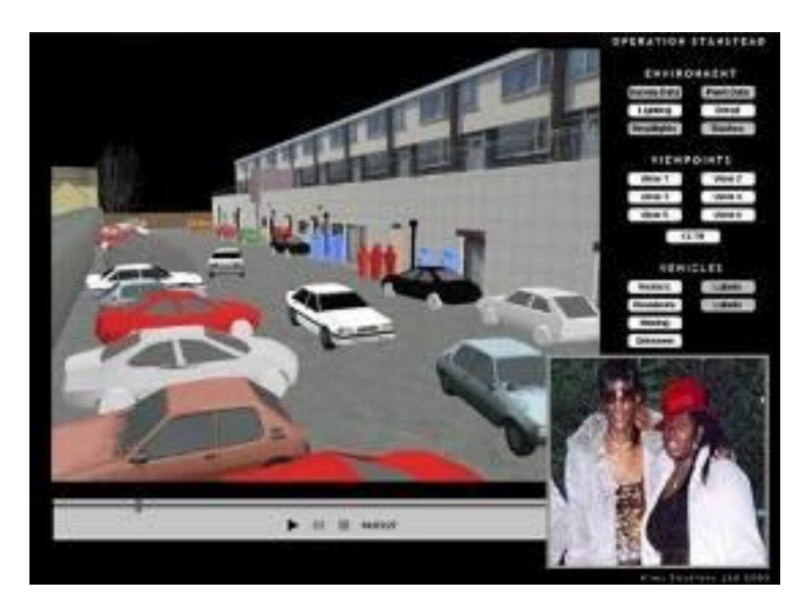
Figure 6. Image from a Virtual Simulation of a Drive By Shooting

An interactive crime scene briefing tool was created (figure 6), with all people and vehicles involved represented in the virtual environment (over sixty moving objects) over a two hour time window. Objects were positioned based on CCTV footage, physical evidence recovered from the scene and witness testimony. This allowed the user to view the crime scene and event chronology in an interactive way, updating the virtual evidence as and when new information came to light (Burton et al, 2005; Schofield and Goodwin, 2007; Schofield, 2007). The final version of this briefing tool was then used in court to aid in the conviction of four men for the shootings <<u>http://news.bbc.co.uk/2/hi/uk_news/england/west_midlands/4366177.stm</u>>.