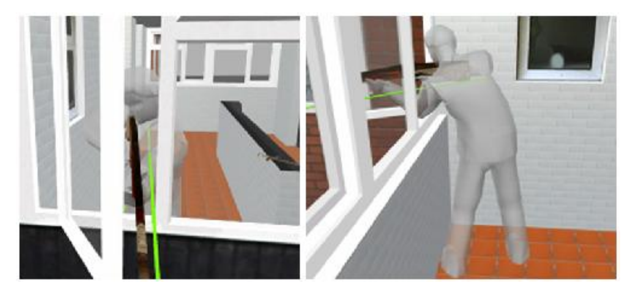
Figure 4. Two Images from a Forensic Animation of a Bullet Trajectory Reconstruction

transparent mannequin was used allowing the bullet trajectory (shown in the images in figure 4) to be visible throughout the animation.