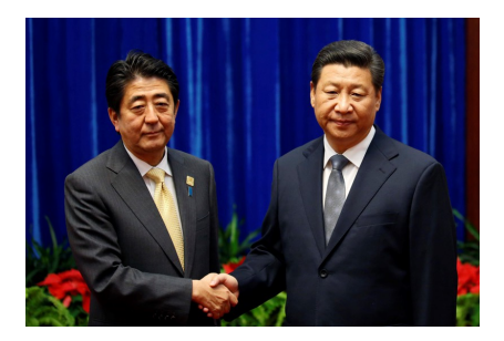
Abe-Xi summit in November 2015: who is encircling whom?

times towards China; and China itself has simply refused to engage in depth with Japan, continuing to bolster its position in the region and in some ways encircling and challenging Japan. The Abe-Xi Jinping summit in November seems to have resulted more from Sino-Japanese stalemate than any inspired moves by Japan to gain strategic advantage. Abe's three arrows of his foreign and security policy, hence, risk becoming as mixed in their accuracy and effect as the three arrows of 'Abenomics'.[iv]