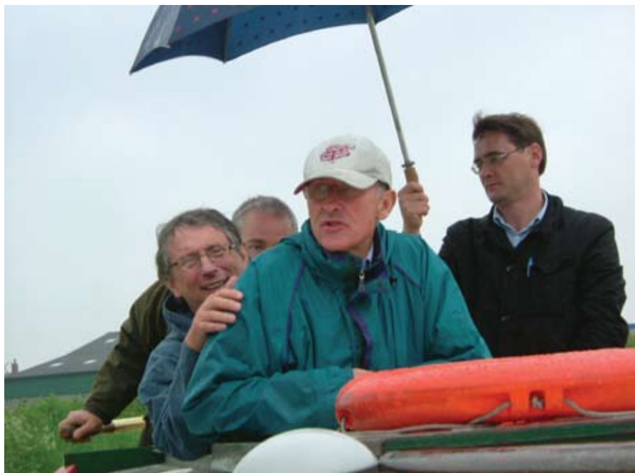
CSME researchers, on a day out on the Grand Union Canal, speculating whether a fast growth business needs a 'capable crew' or a 'fast flowing current'.

Stephen Roper's work continued to focus on innovation throughout 2008 with a focus on modeling firms' innovation success and its links to growth and productivity. The innovation value chain paper published in