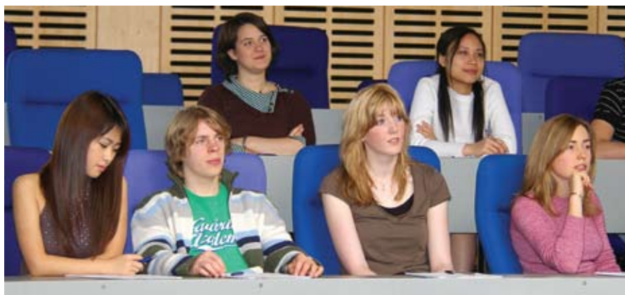
Undergraduate students at WBS.