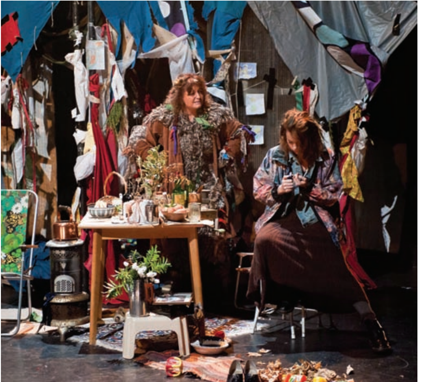
Warwick University Dramatic Society's award-winning production of 'The Bog of Cats', 2010