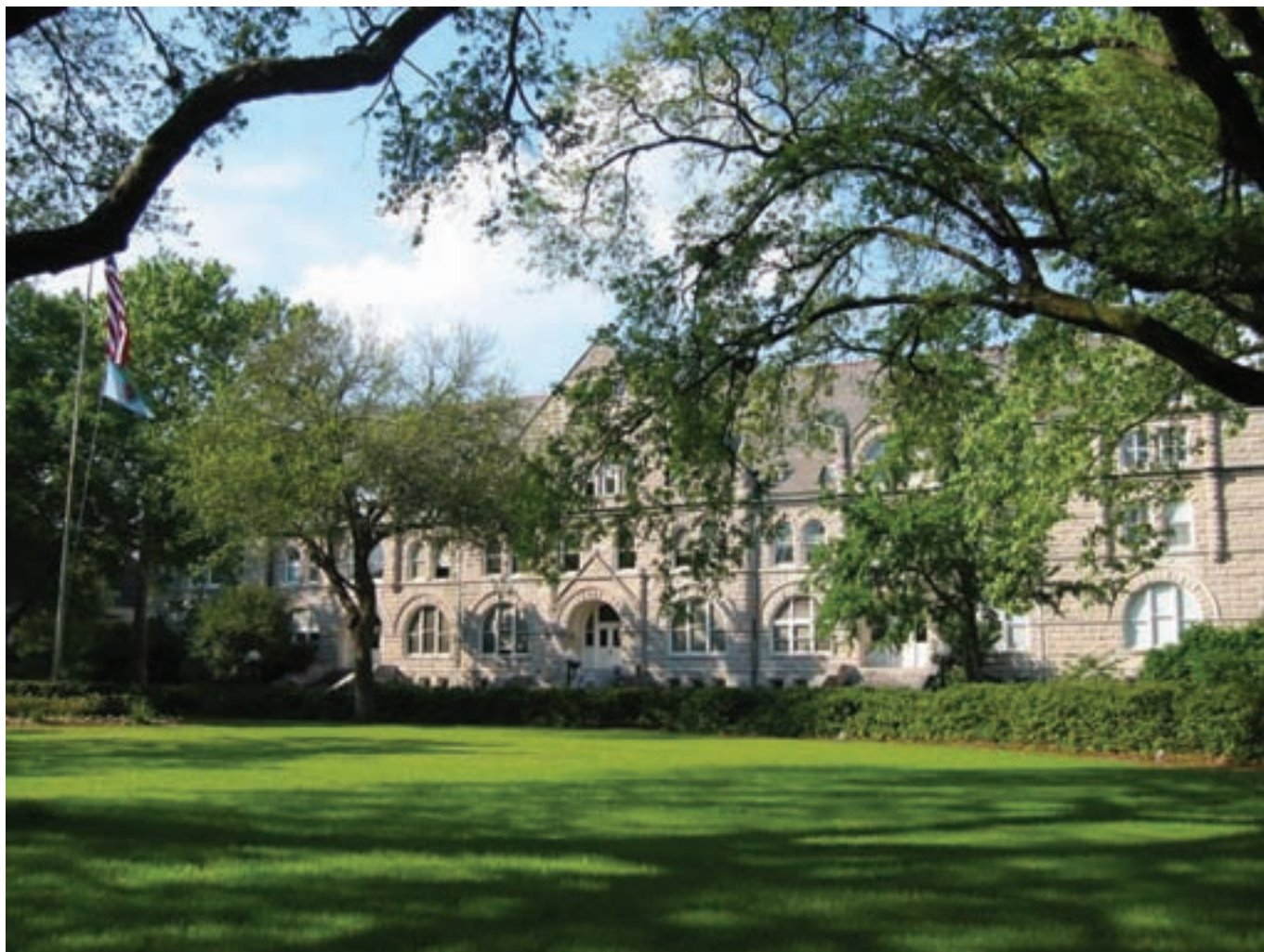
Tulane University, New Orleans, USA