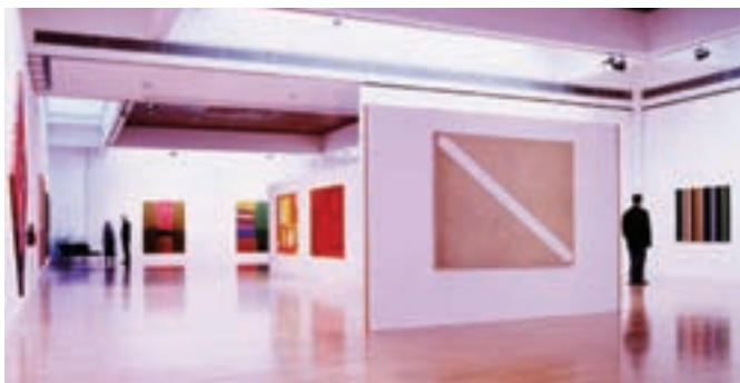
The Mead Gallery (above and right) and (below right) a still from the Australian animated film 'Mary & Max'