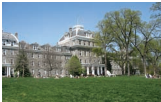
Swarthmore College, Pennsylvania, USA