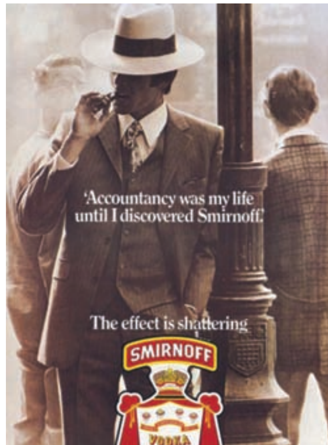
A Smirnoff advertisement from the 1970s