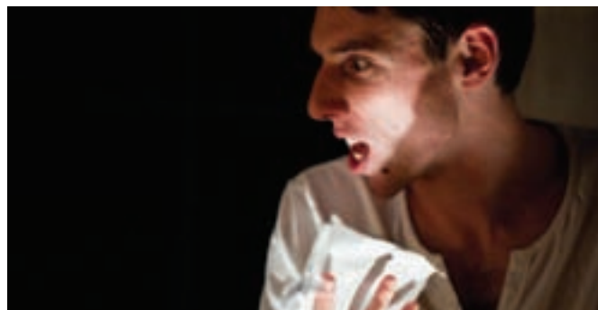
'Diary of a Madman', the Arts Centre, Autumn 2010