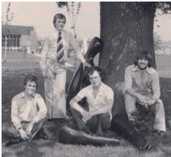
The Coull Quartet on their appointment as the University's Quartet in Residence, 1977 and (right) the current Coull Quartet