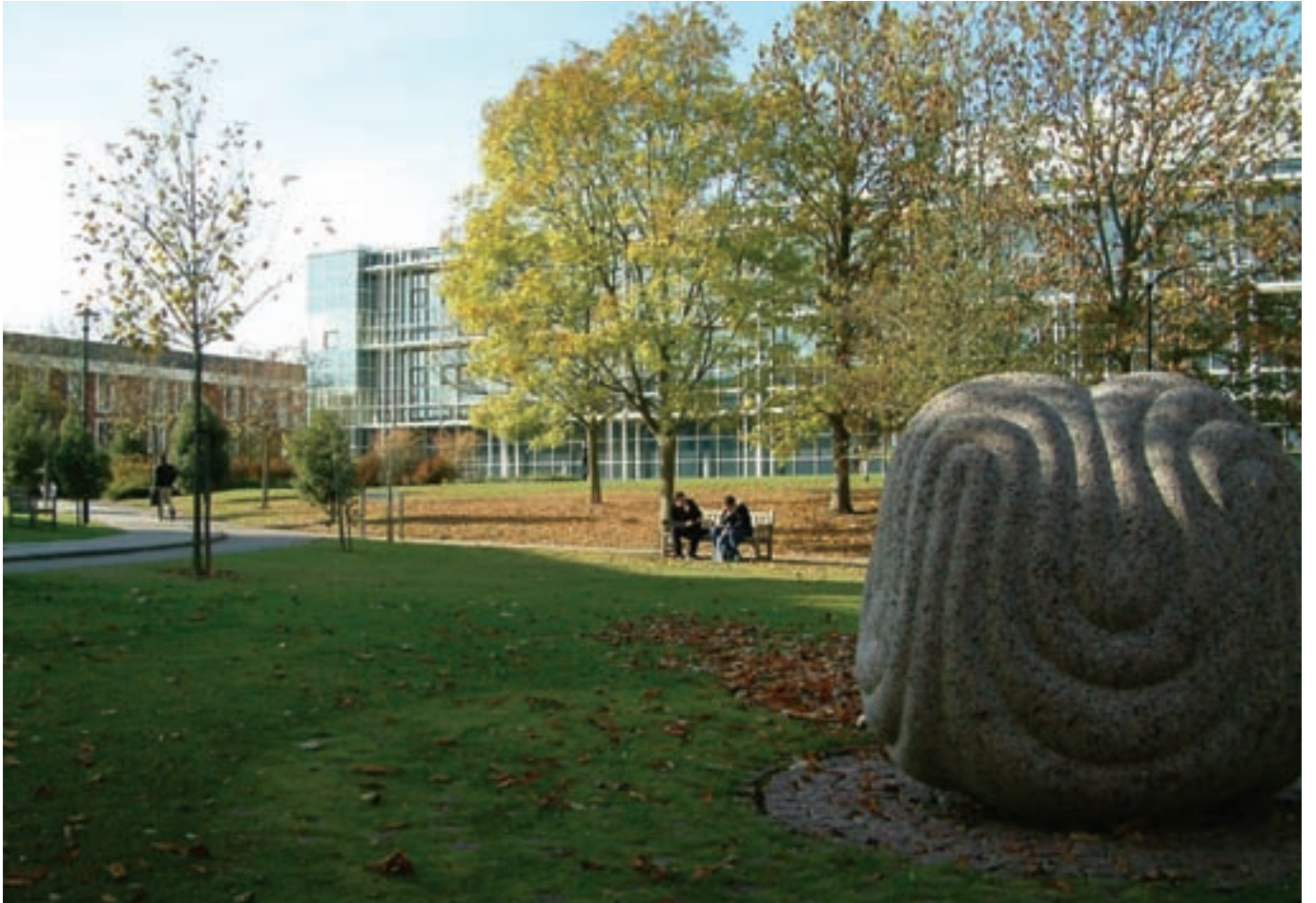
The Modern Records Centre