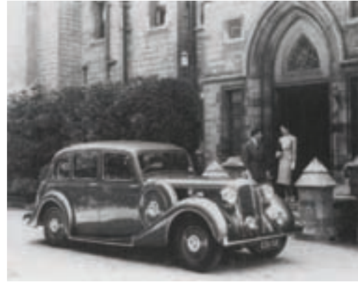
A 1930s' Daimler