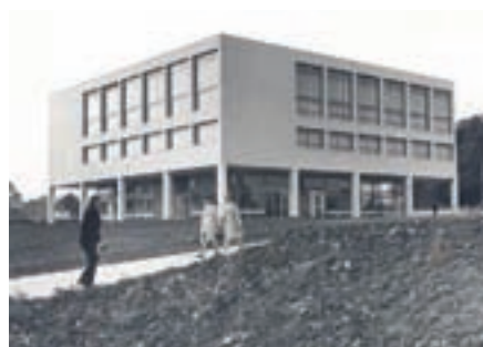
Benefactors Residence, 1967