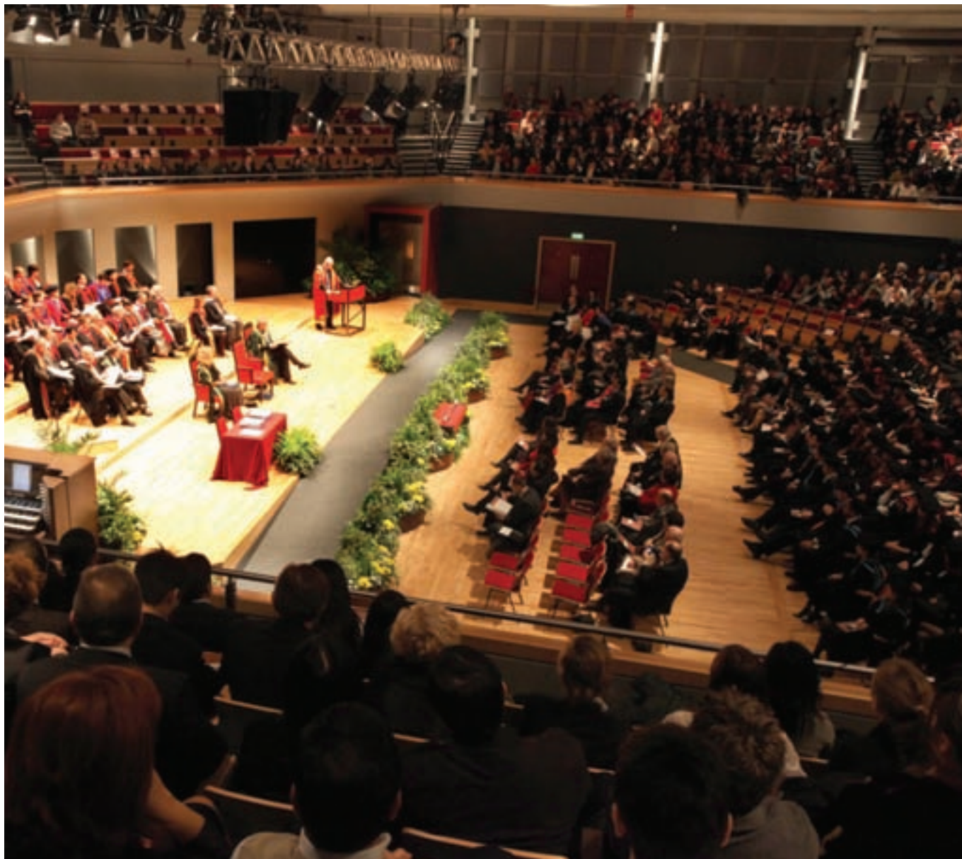
Degree Ceremony, Butterworth Hall, 2010