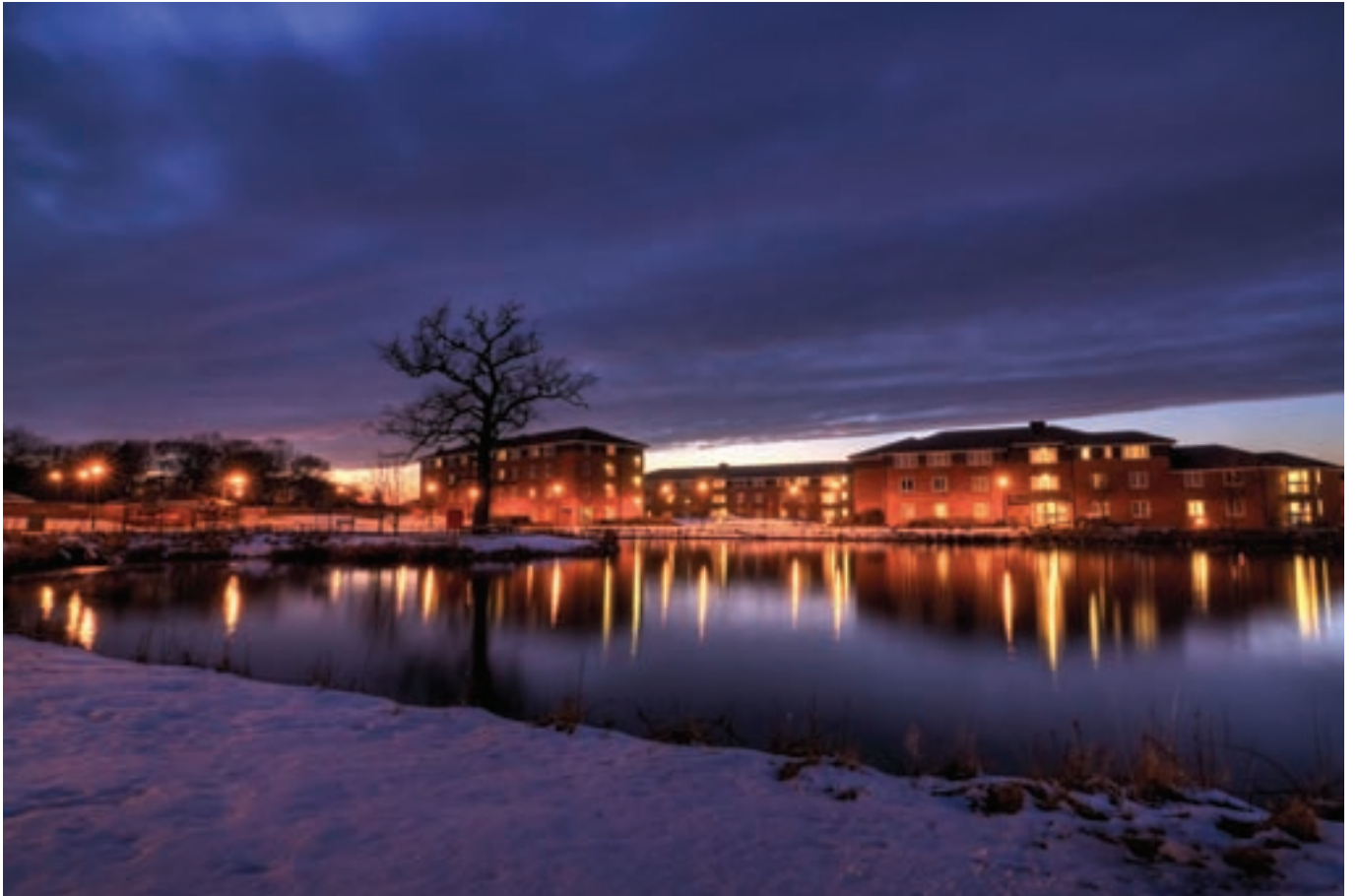
Lakeside Residences, built on the University's recently developed Warwickshire land