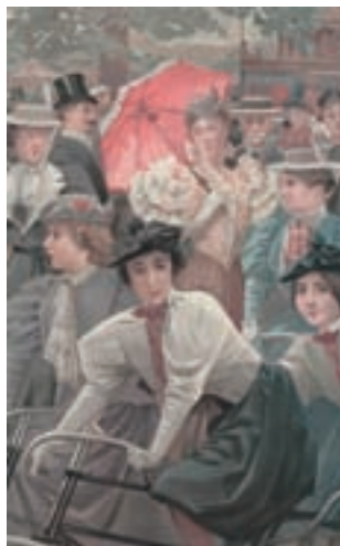
The Modern Records Centre is home to the National Cycling Archive

IN 1990, THE UNIVERSITY WAS ONE OF A SELECT GROUP OF universities invited to bid to attract the BP Archive, one of the most significant business archives in the UK. BP had offered to pay for a new building and pay the running costs for the archive to be moved out of London. The University had built up a Modern Records Centre comprising the archives of all the major trades unions, the TUC, the CBI and much other material of historical and political importance, but this was housed inadequately within the University Library. Finding more space for the Centre was already an important academic priority so as to be able to compete with Oxbridge and London in creating research collections and attracting graduate students to the University. The Trust offered £500,000 to match a similar sum from the University to build a new Modern Records Centre which would incorporate the BP Archive. This persuaded BP to select Warwick over Cambridge to house its archive and a new combined Modern Records Centre was built adjacent to the University Library. The University now has the largest collection of modern archival material outside London and is able to provide superb working conditions for visiting scholars as well as its own staff and research students. A new grant from the Trust of £50,000 will enable the Centre to make its archive even more accessible to users through a range of new digital and physical means. *