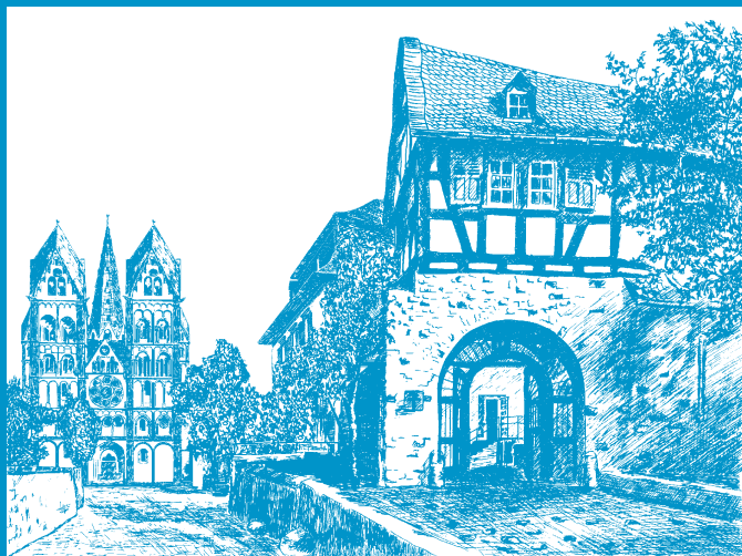
Diocesan Museum of Limburg, Domstraße 12