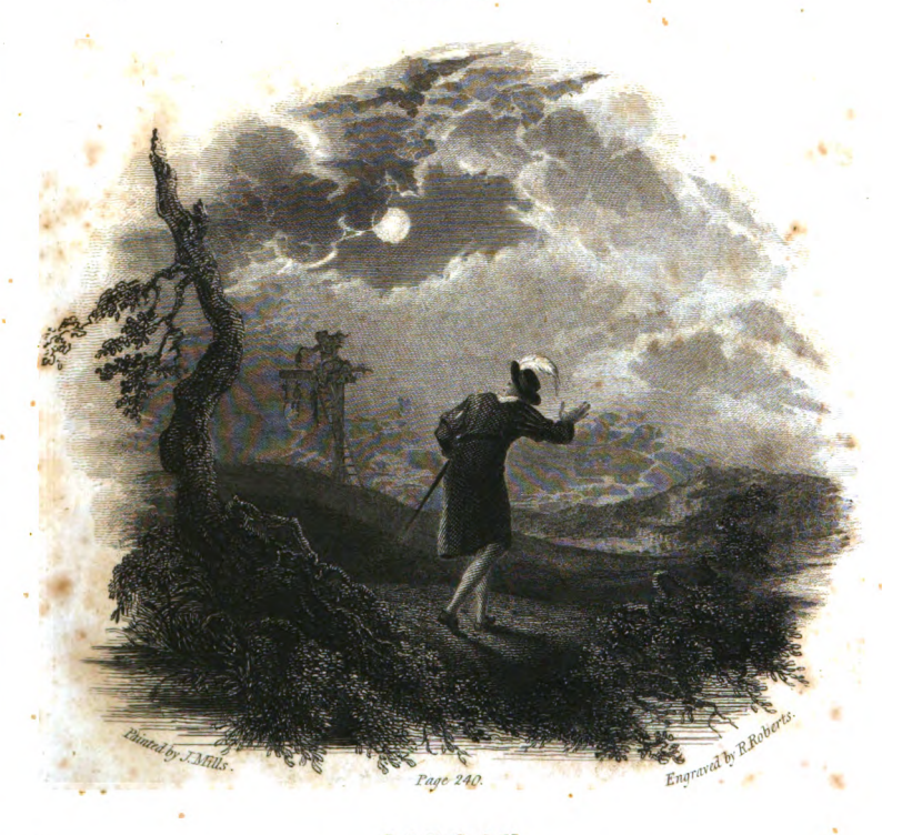
LONDON. Printed for SEPTIMUS PROWETT, 23, Old Bond Street, 1825.