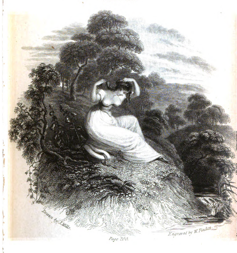
L O N D O N. Printed for SEPTIMUS PROWETT, 23,01d Bond Street; 1825.