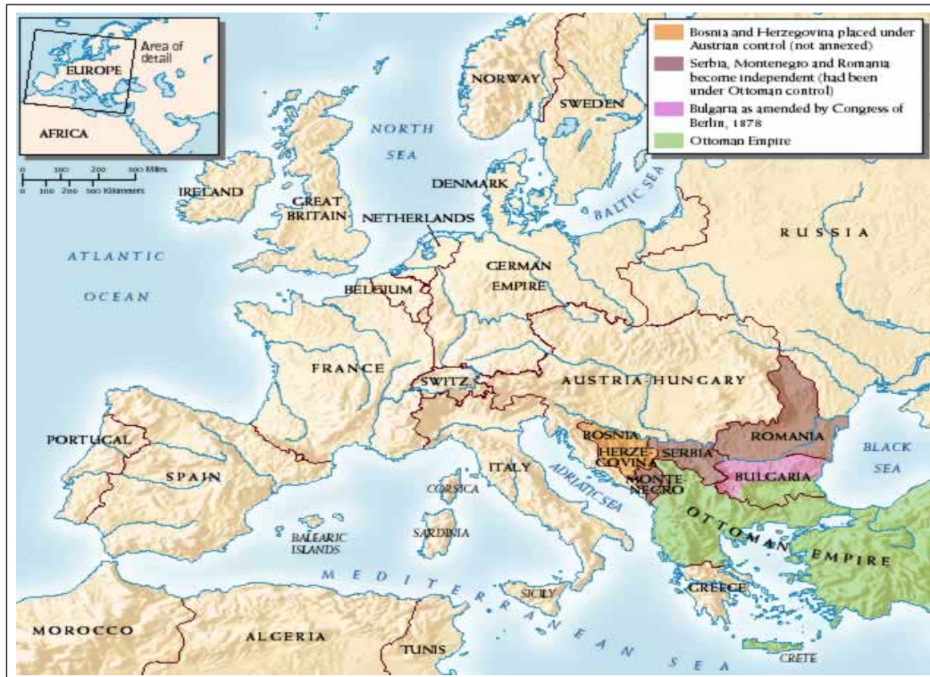
Map 1. Europe after the Congress of Berlin 1878