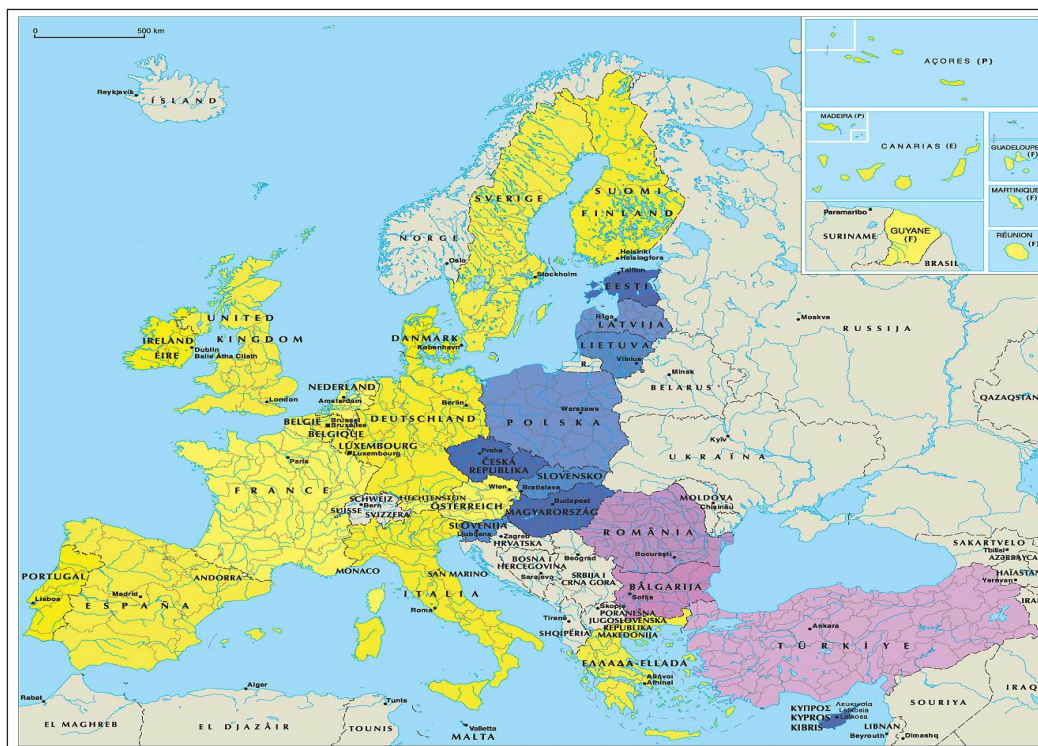
Map 3. EU Enlargement 2004 (dark grey), 2007 (light grey) and pending (lighter grey)