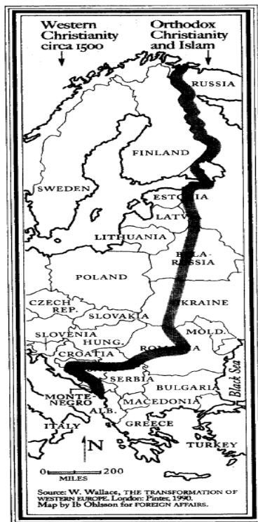
Map 2. The Transformation of Western Europe

nity is taken to have been essential as well: According to Huntington, whereas Western Christianity was both actively involved in, as well as shaped, by feudalism, the Renaissance, the Enlightenment, the French Revolution, and industrialization, both Orthodox Christians and European Muslims have only been “lightly touched” (Huntington 1993: 30) by them. Along the same line, stable democracies are considered a likely prospect for countries of the West, not, however, for those on what obviously represents the “wrong” side of the curtain.