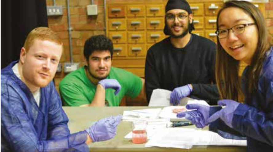
Students from School of Life Sciences, Economics, and Film and TV Studies

In its first year, the 'Genetics: Science and Society' module experimented with student devised assessment. The module focuses on the latest human genetic technologies and the interactions between science, society, politics, and culture. Students are involved in interdisciplinary team-based learning activities and, in a peer-informed and collaborative manner, they undertake a variety of tasks that span from role-play activities to open-space learning sessions that embody the different inquisitive approaches of both the scientific and humanities disciplines.