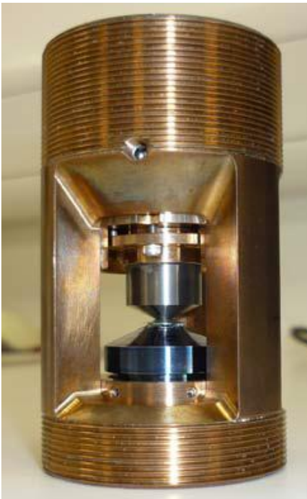
Fig. 1 Photograph hybrid-anvil-type high pressure cell.[2]