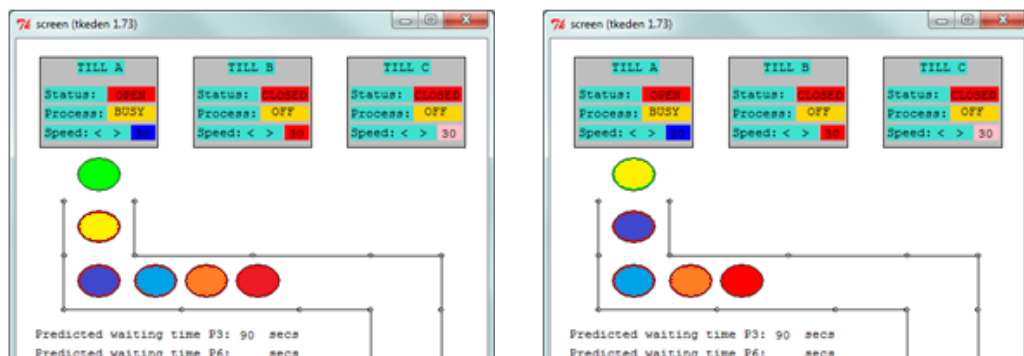
Figure 2: A queuing model that clearly shows people moving up the queue by using colours.

Lastly, Empirical Modelling uses the concept of iterative improvement. This is the idea that software can be developed slowly, giving opportunity for experimentation. The user is able to witness how changing variables influences the model output, and can make appropriate changes based on this.