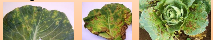
Symptoms on cabbage

The work on Brassica diseases has been funded by several institutions including Defra, DFID and BBSRC of the UK and FCT of Portugal.