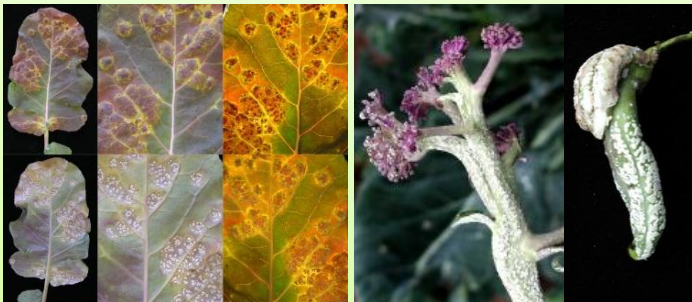
White rust symptoms on broccoli