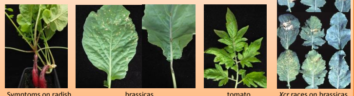
Symptoms on radish