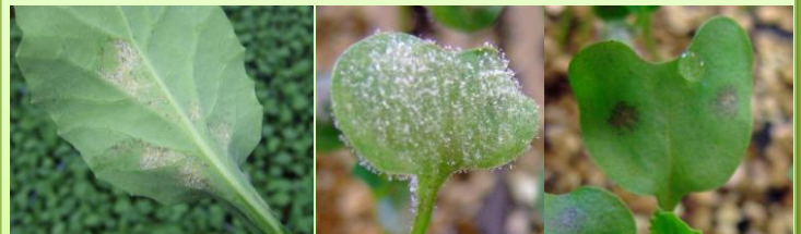
Symptoms in a UK nursery