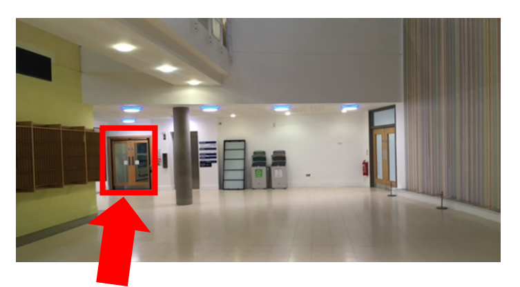
Step 3: Walk straight ahead, past C0.02 and through the locked door (card access required) and turn left at C0.05 & C0.03