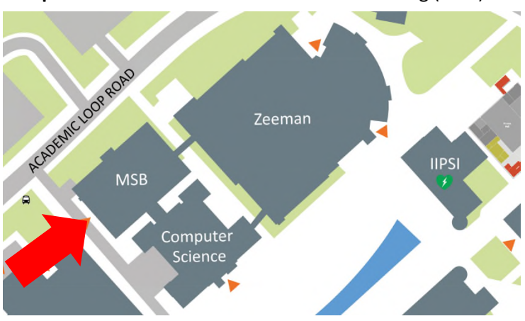
Step 1. Enter the Mathematical Sciences Building (MSB) via the main entrance