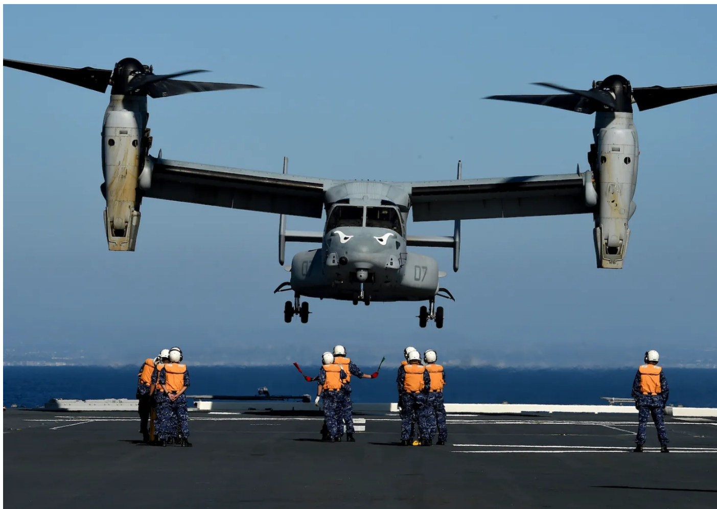
Japanese sailors aboard the Japan Maritime Self-Defense Force (JMSDF) ship JS Hyuga direct a US Marines MV-22 Osprey to land during the Dawn Blitz 2015 exercise off the coast of Southern California.

comprehensive military expansion — views any increase in Japan’s capabilities negatively.