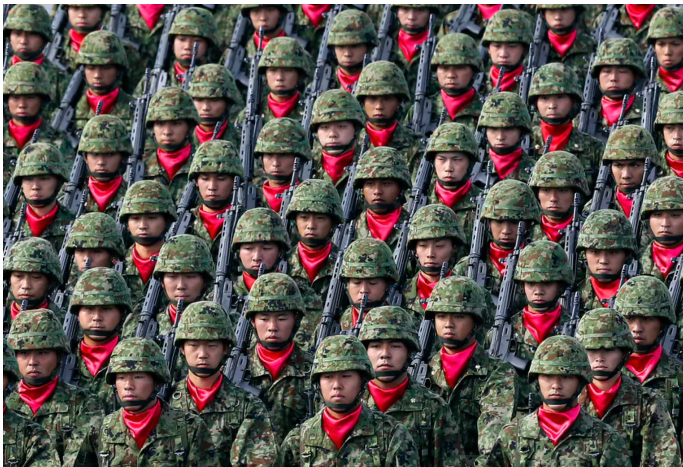
Japan's Special Defense Forces poised to become more offensive.

Japan has restructured its defense architecture and stated it will build a Multi-Domain Defense Force that will allow it to respond to threats from land, sea, air, space, cyberspace and the electromagnetic spectrum.