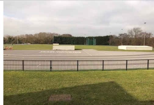
View from East track entrance adjacent to the games hall