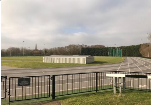
Cage and track near the West boundary