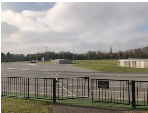
Photo taken of the Race track entrance gates