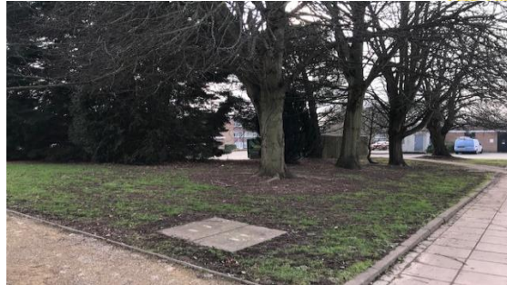
Land to the left of the Bandstand