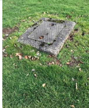
Exposed manhole cover