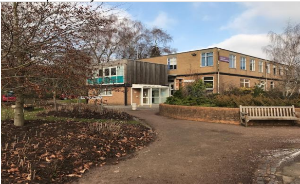
Pathway to Centre for Lifelong Learning