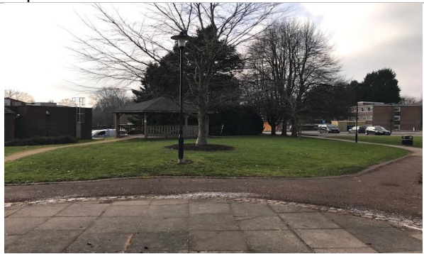
Photo taken from the east side of the site