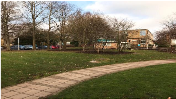
Photo taken from the west side of the site