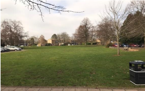
Green space adjacent to the Bandstand