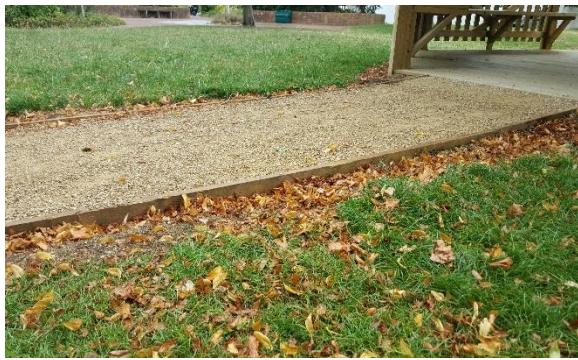
Pathway edge strips- trip hazard